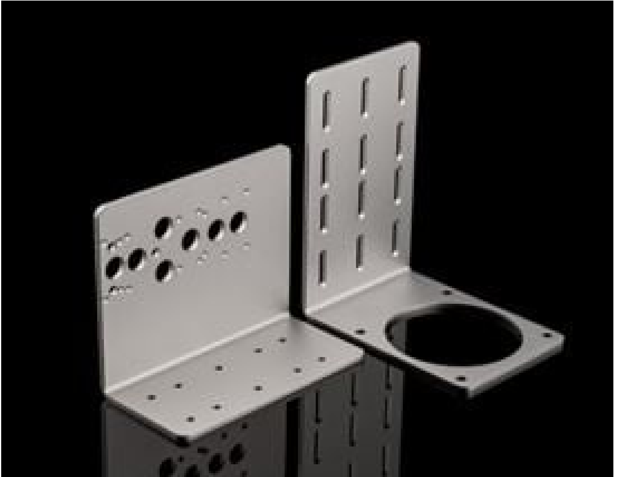
Vertical Mounting Bracket, #34-867