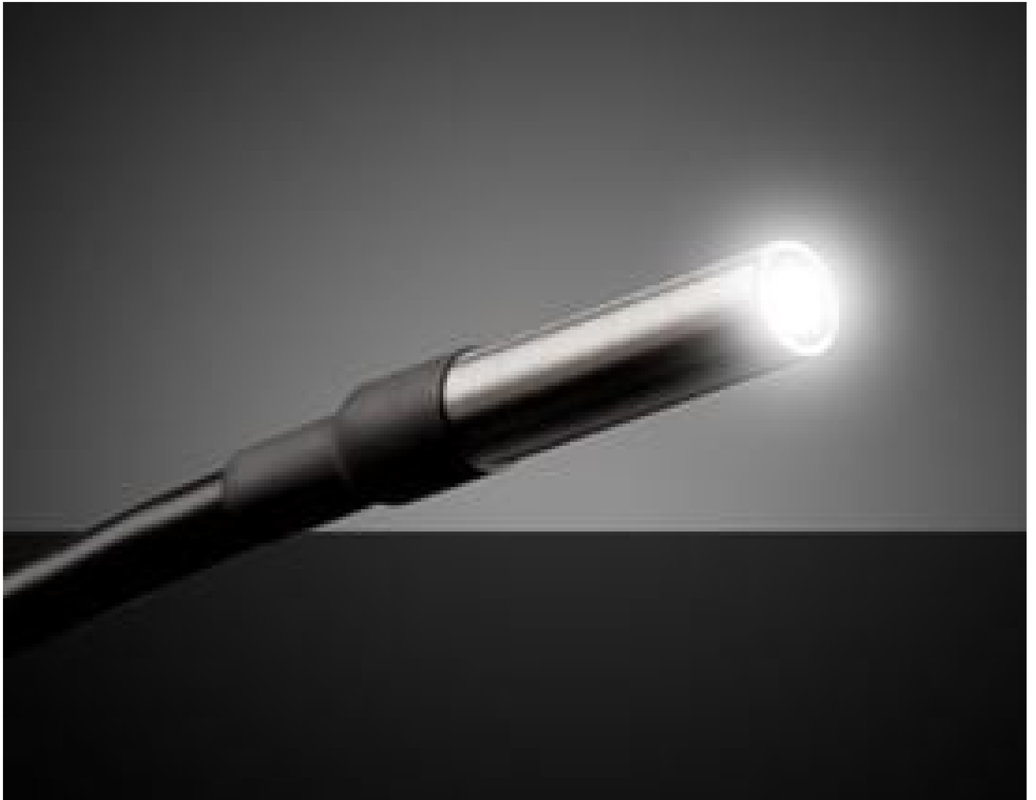
Advanced Illumination MicroBrite Spot Light