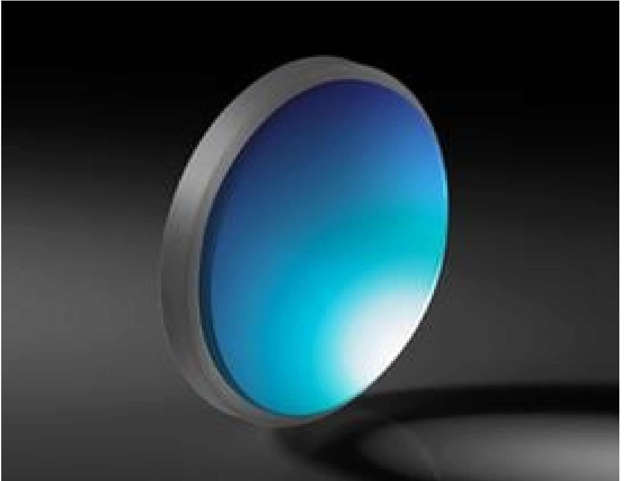
Unmounted Widefield 120i Tube Lens Lens