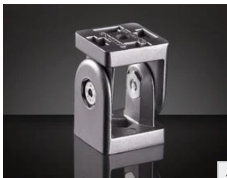
Swivel Mounting Accessory, #34-889