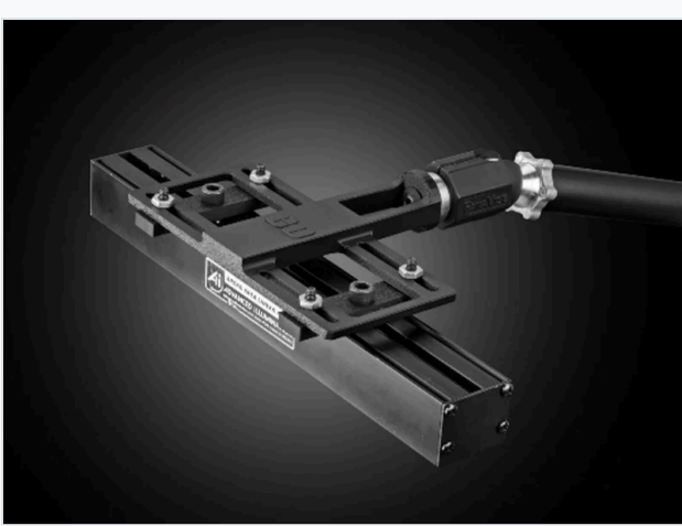
Bar or Line Light Configuration