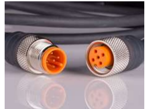
#34-869 - M12 Female to Male, 5 pin, 2m £41.00