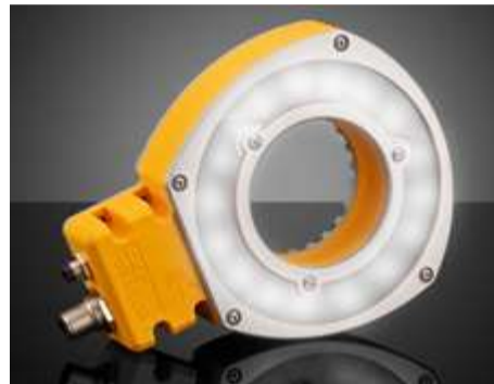
#34-861 - White Adjustable LED Ring Light £573.00