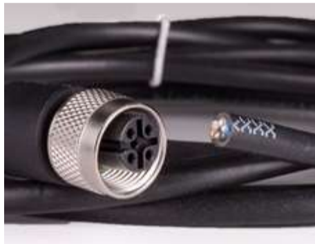
#34-870 - M12 Female to Bare Leads, 5 pin, 2m £30.00