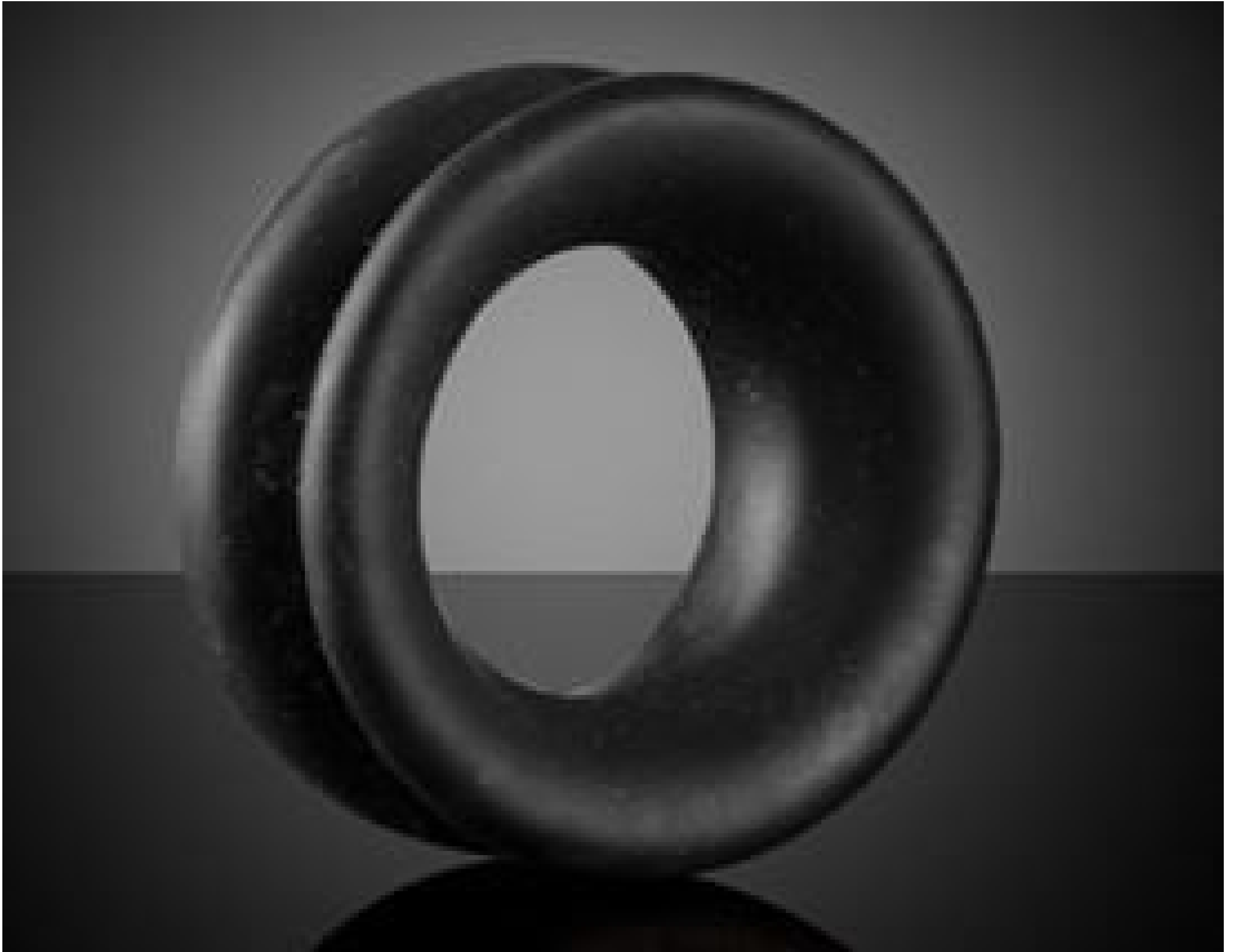
Style B Rubber Eyeguard (1 piece), #60-100