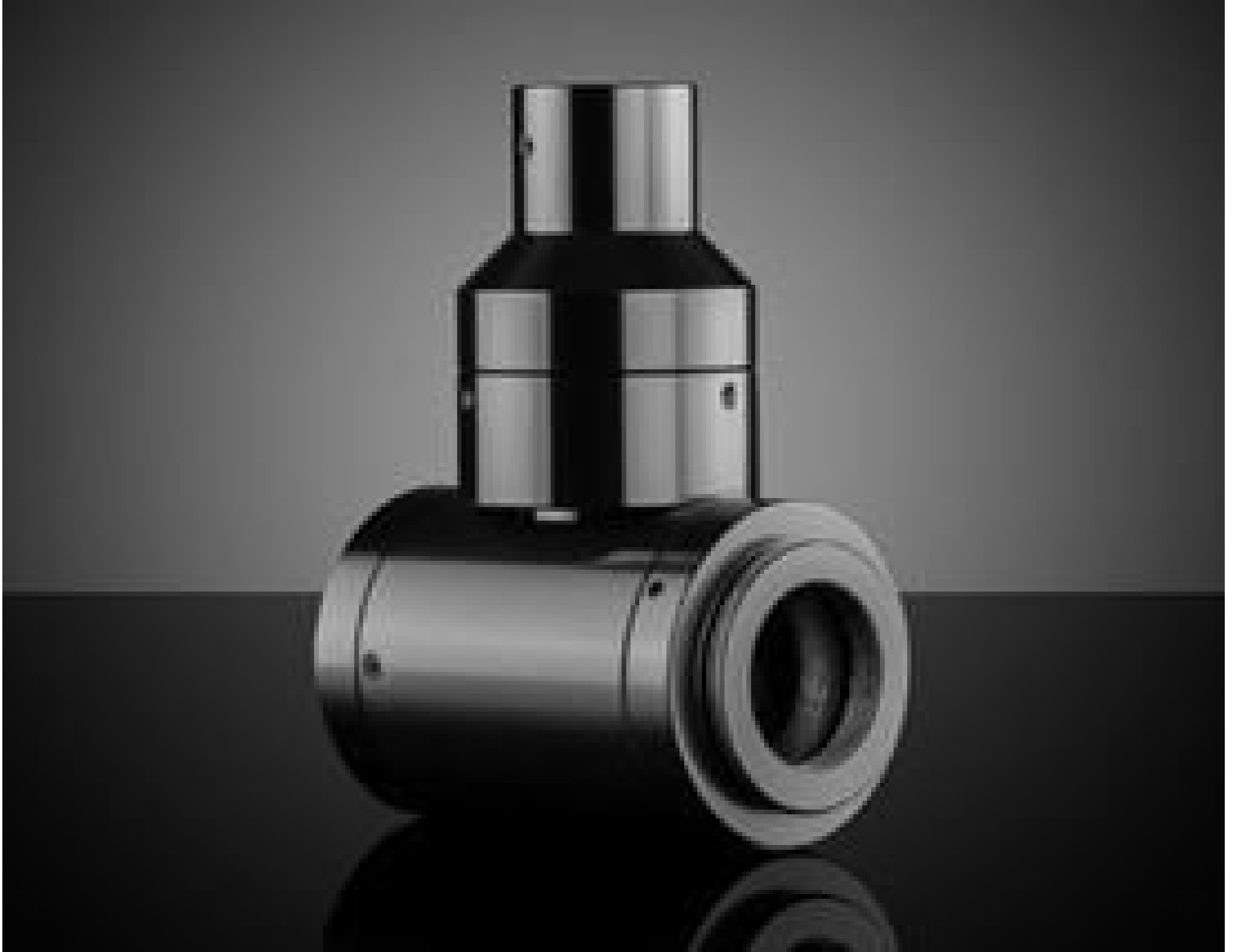
Standard In-Line Attachment (Optimized at 2X-10X), InfiniTube

See More by Infinity Photo-Optical Company