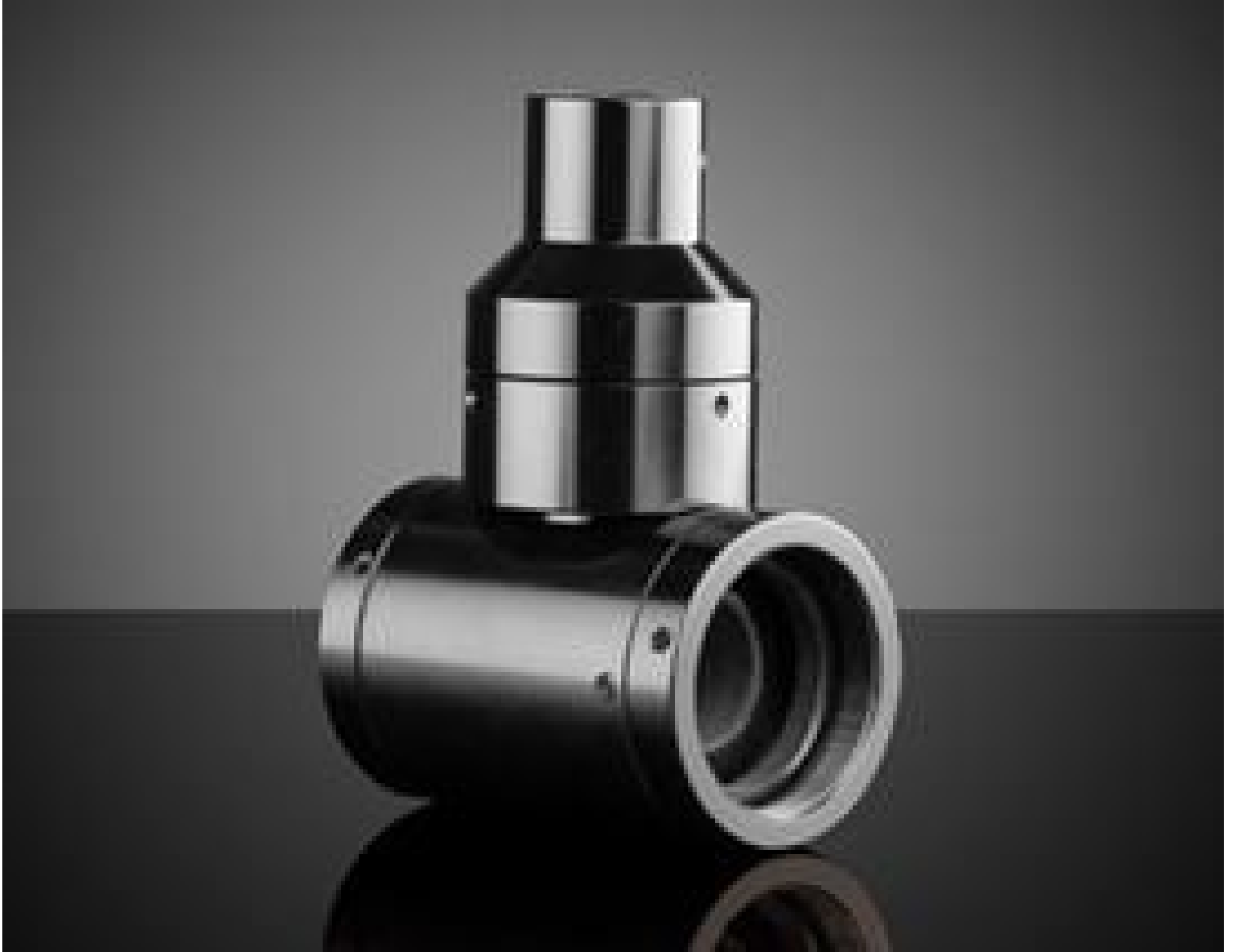
Standard In-Line Attachment (Optimized at 10X+), InfiniTube

See More by Infinity Photo-Optical Company