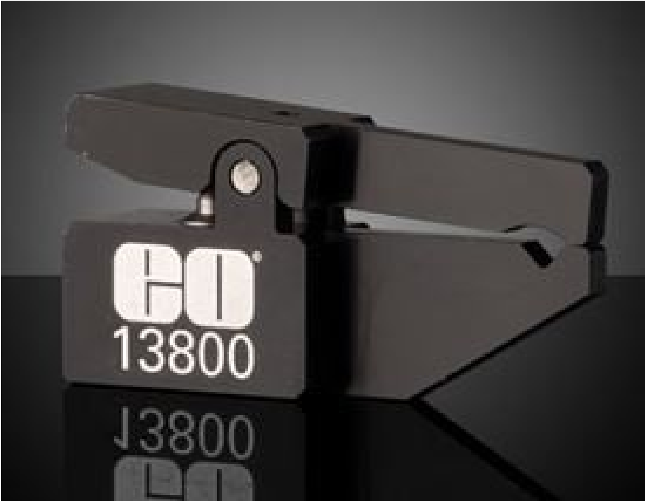
Small Lens Clamp for 4-8mm Dia. Optics. #13-800