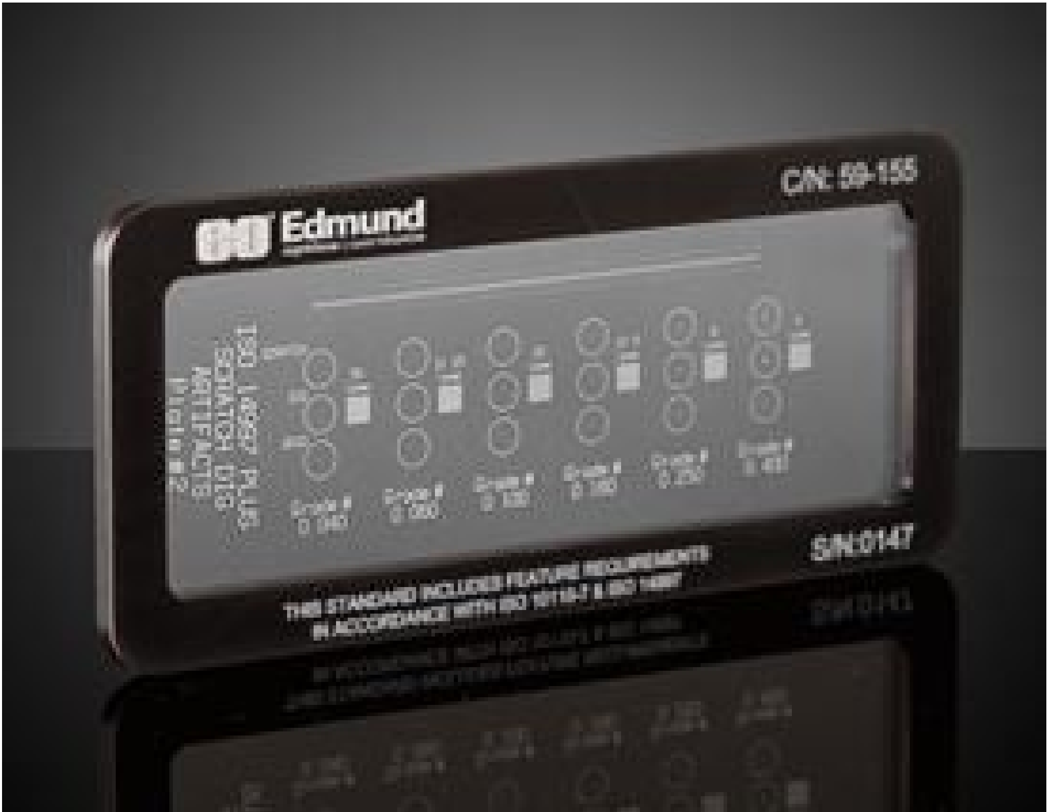
Scratch & Dig Target (2nd Surface Positive), #59-155