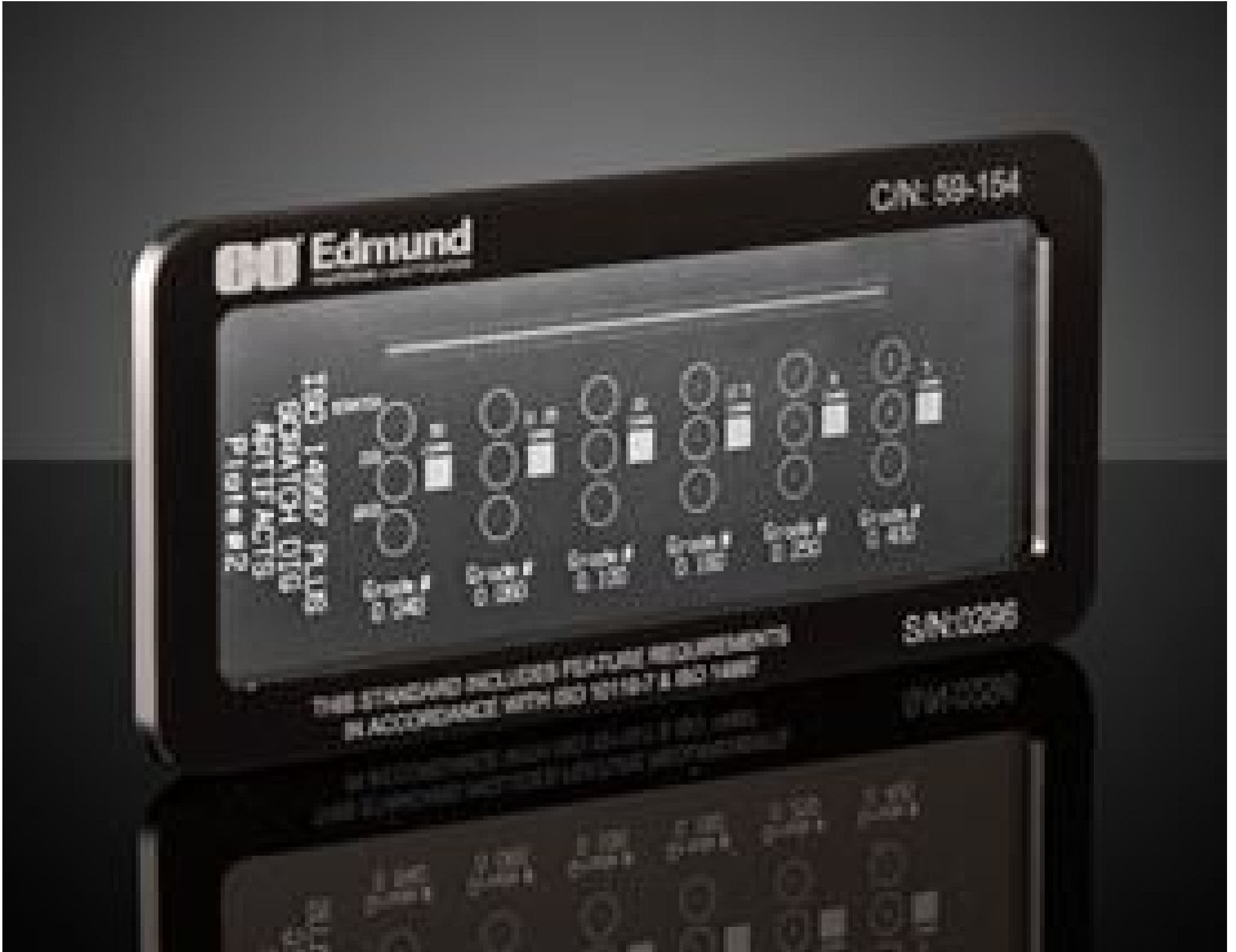
Scratch & Dig Target (1st Surface Positive), #59-154