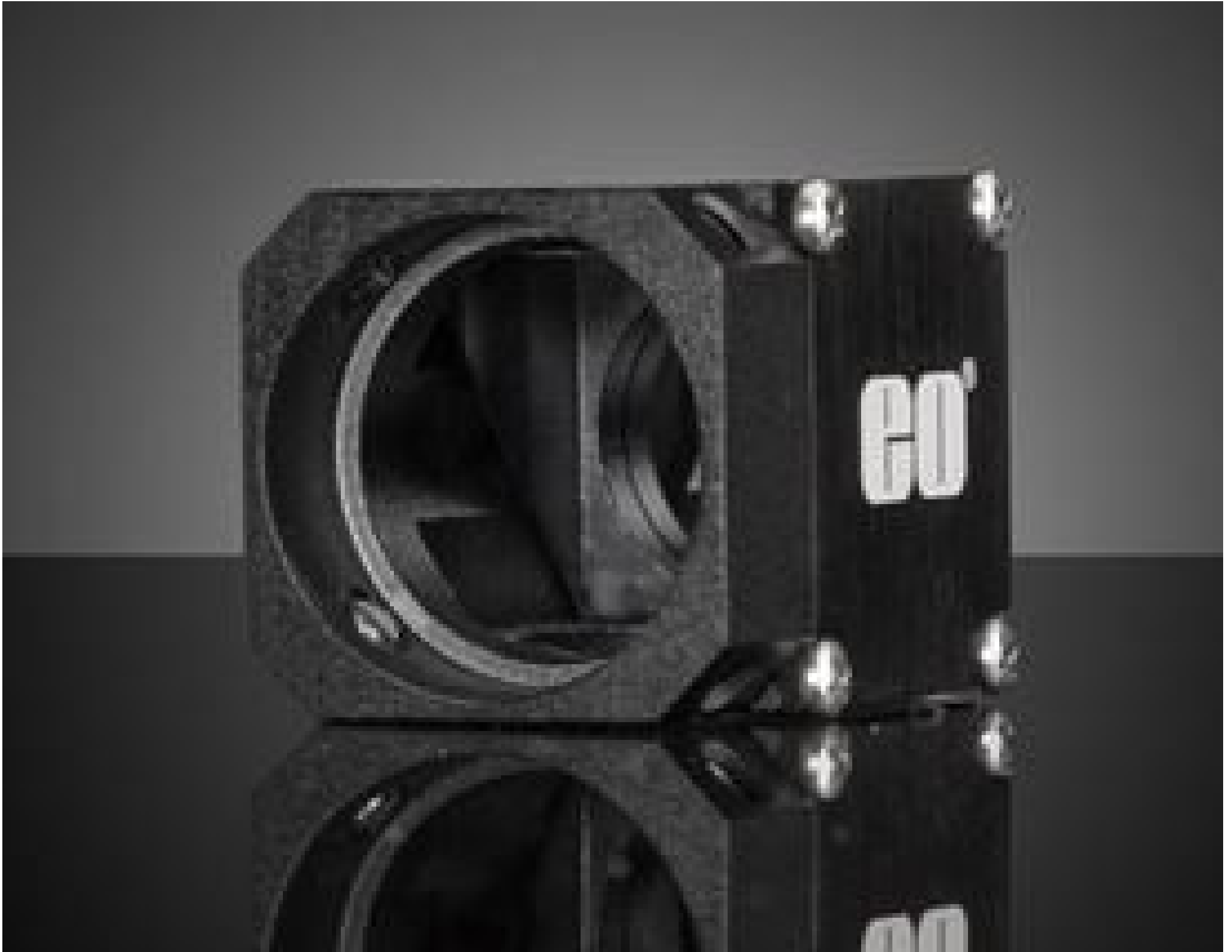
Right Angle Adapter For 18mm Dia. Lenses, #88-215