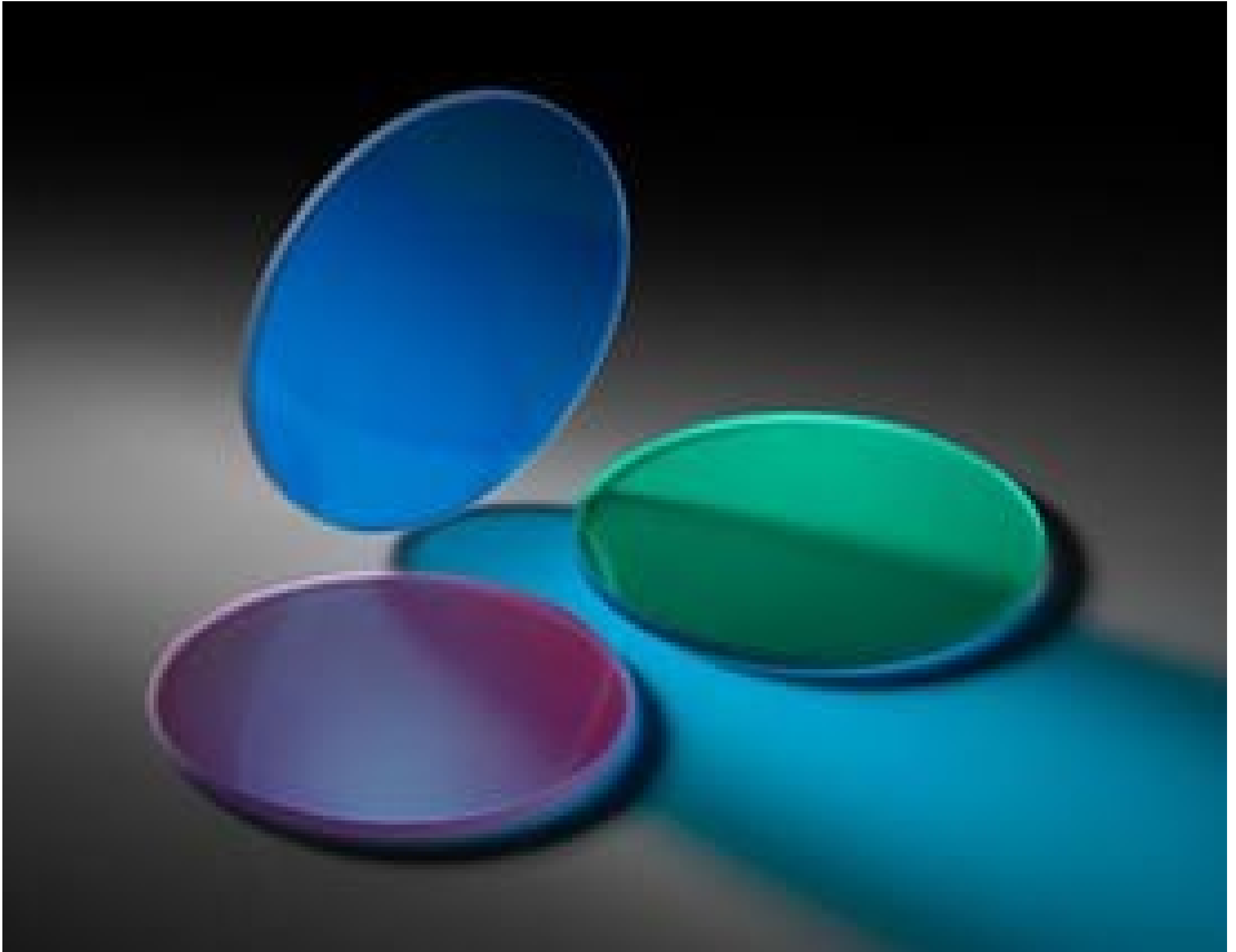
Red, Green, and Blue Dichroic Filter Set