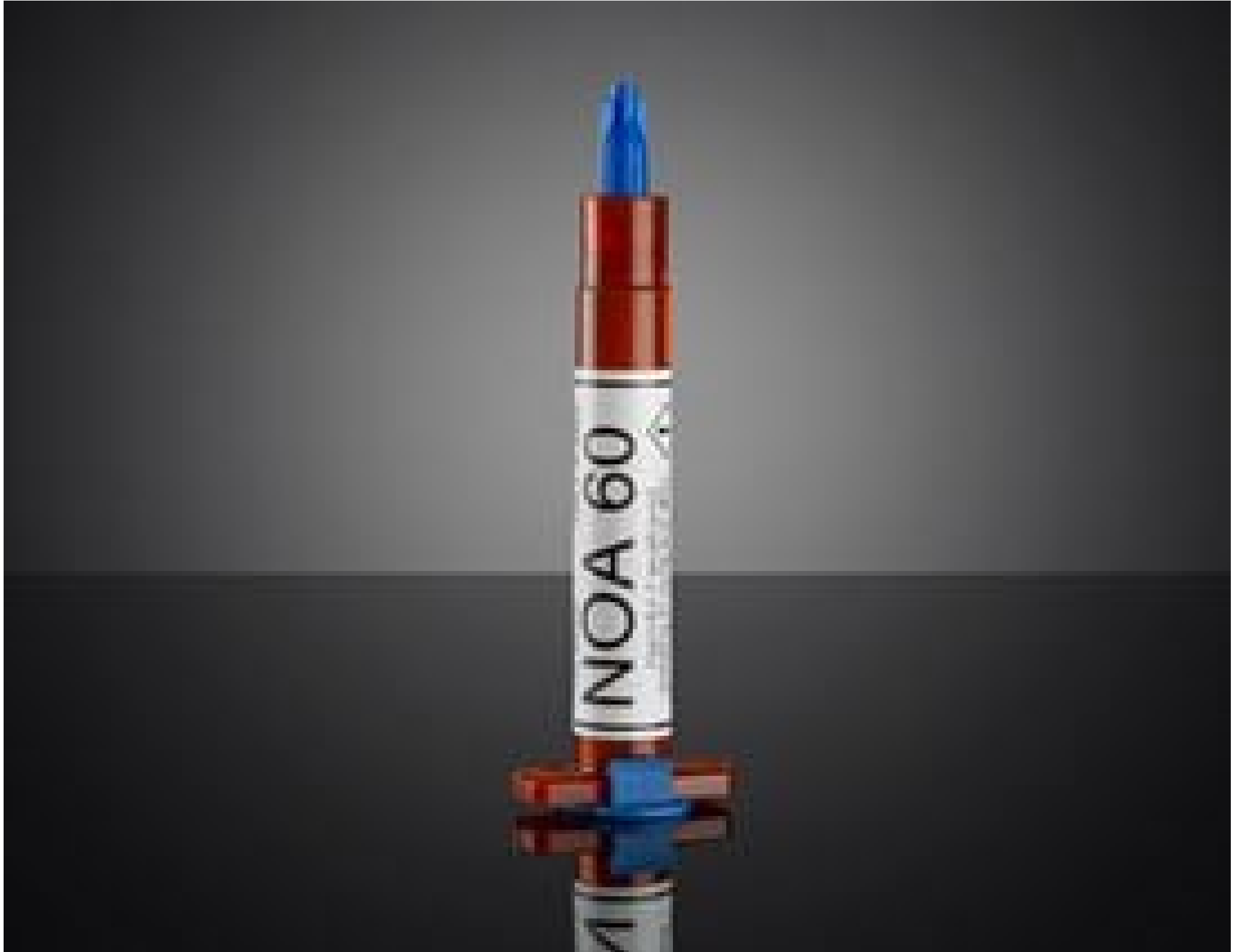
3cc Dispensing Barrel for NOA (NOA60 shown as an example)