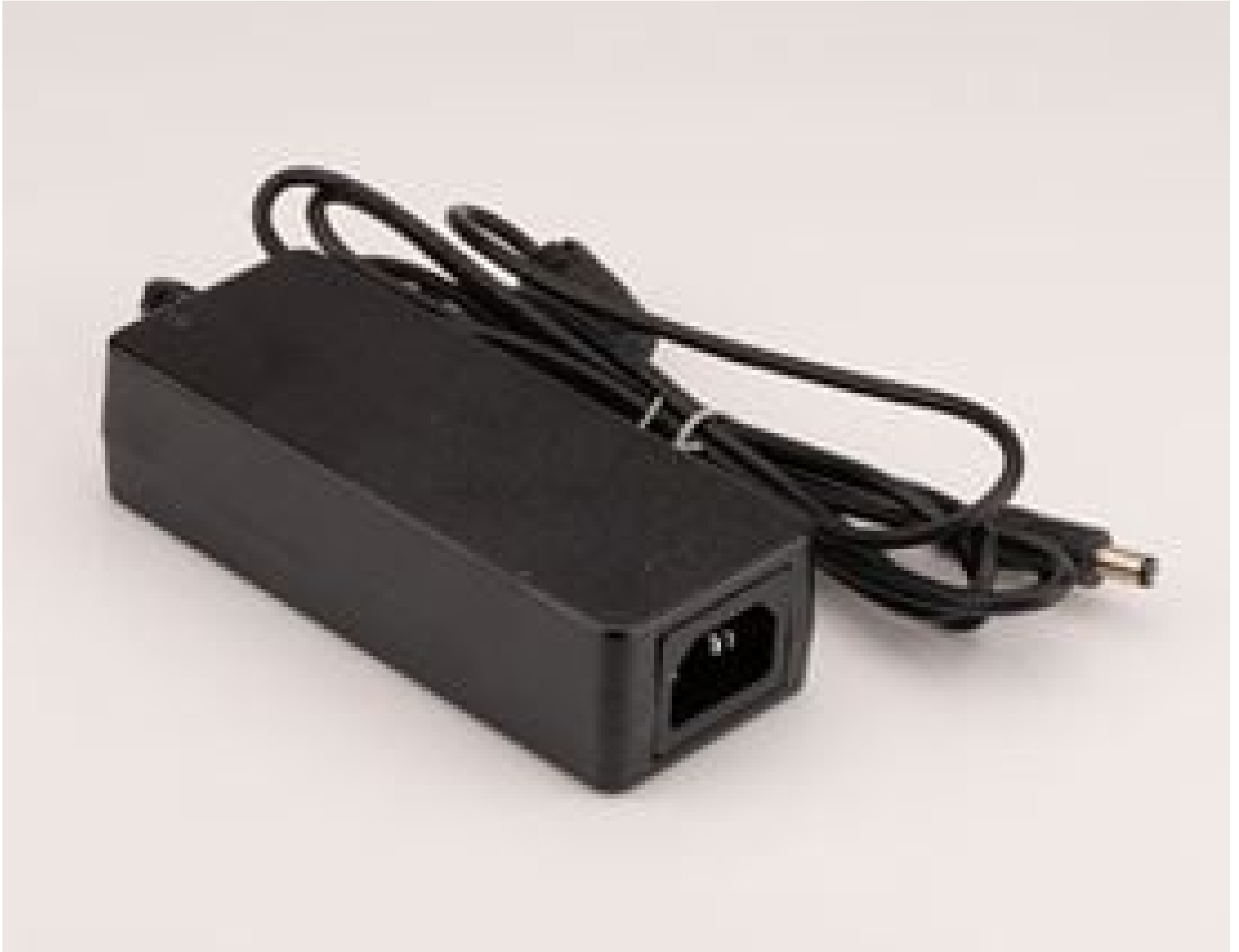
#16-791: Power Supply for SCHOTT VisiLED Ringlights