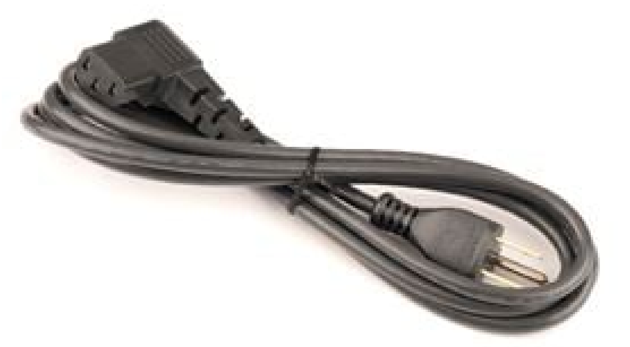
Power Cord for CX43 Microscope (USA) | Olympus UYCP-11