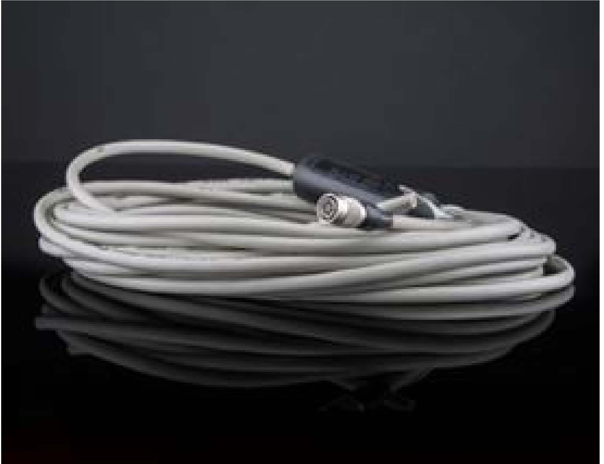
PLC (Programmable Logic Controller) I/O Cable Hirose 6 Pin 10m, #68-467