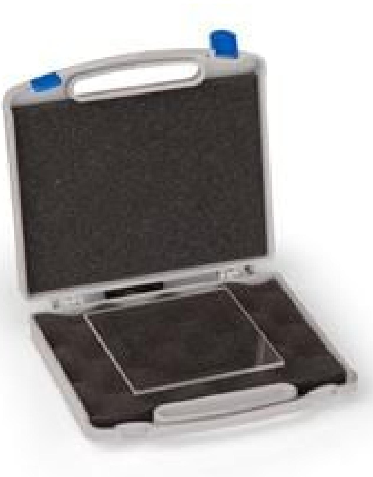
Particle Standard Target