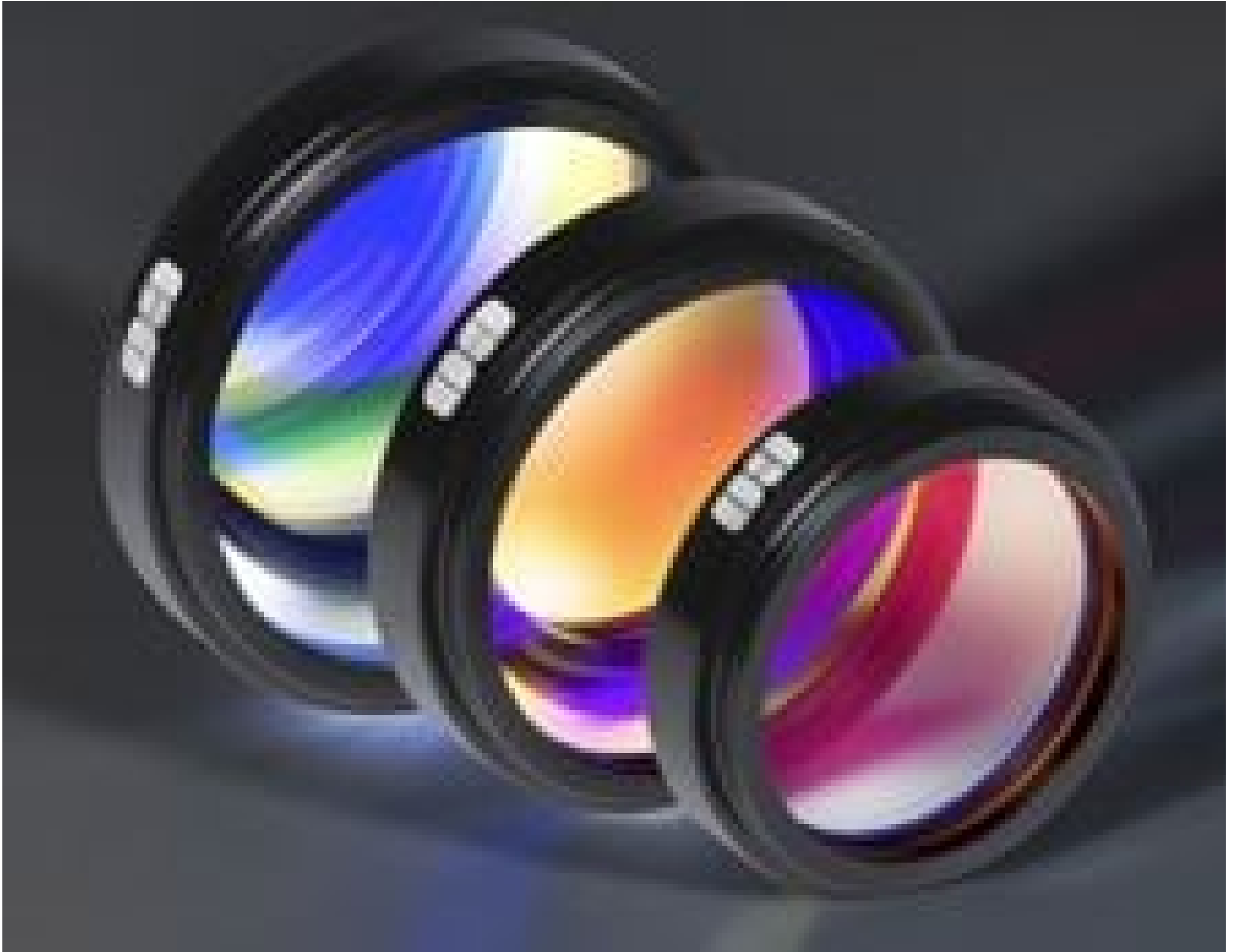
TECHSPEC® High Performance Mounted Machine Vision Filters