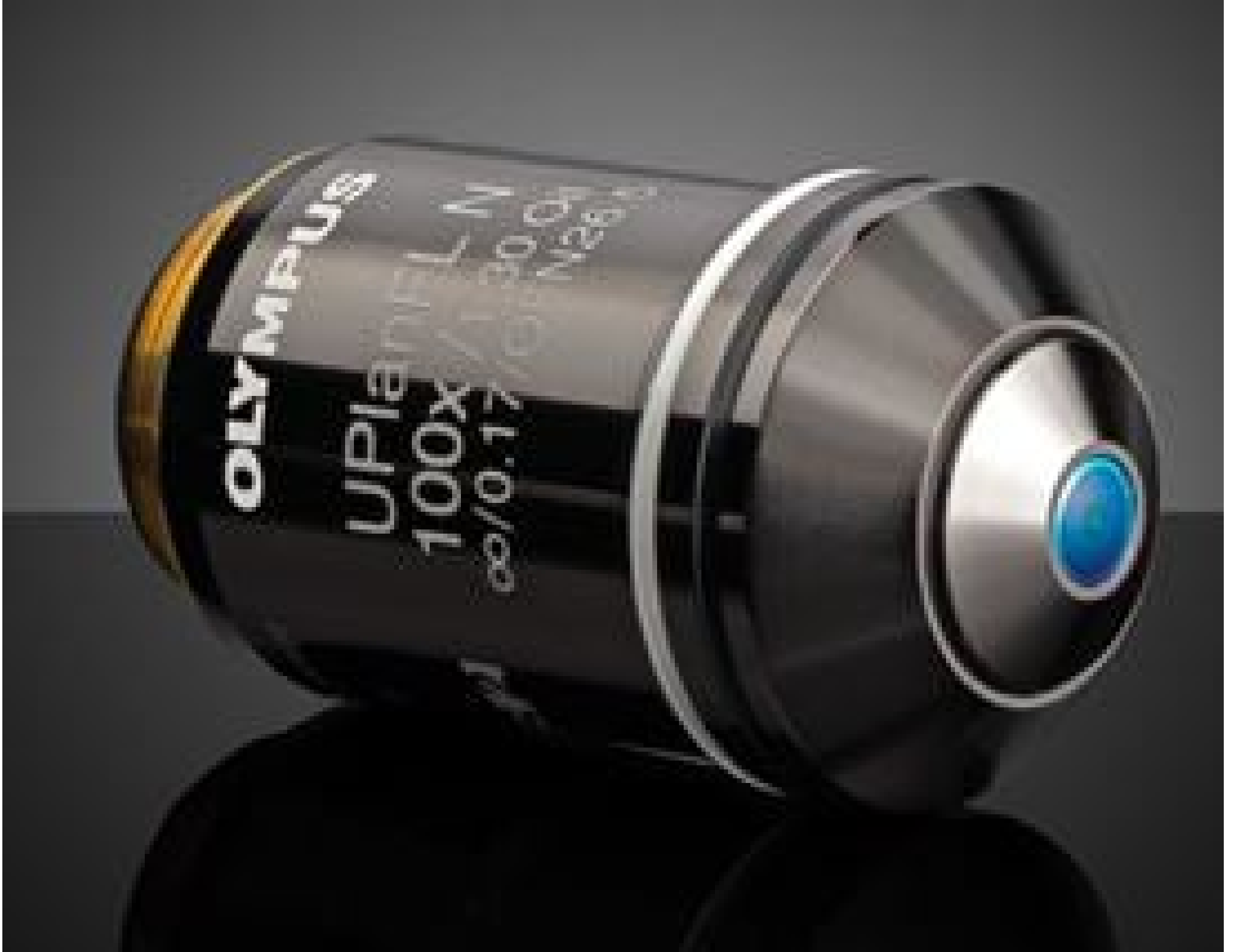
Olympus UPLFLN 100X (Oil Immersion) Objective