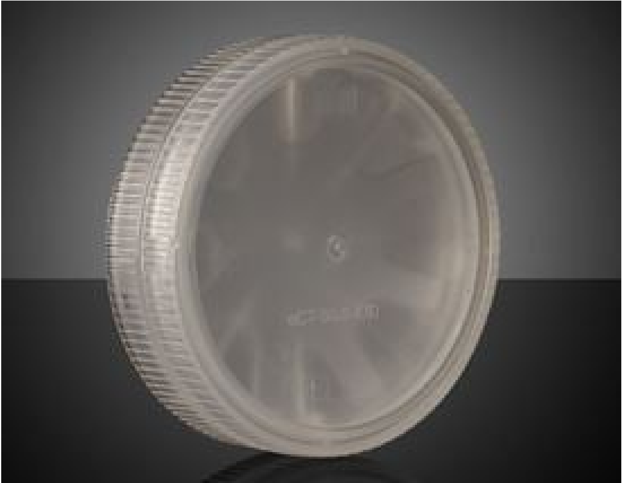
Non-Contact Impact Case for 50.8 Dia. x 9.53mm Thick Optics