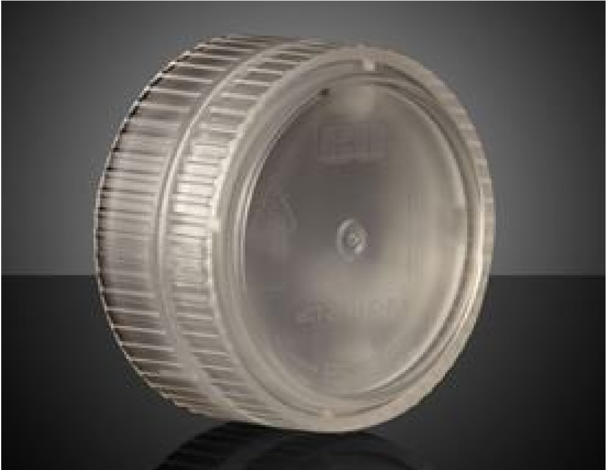
Non-Contact Impact Case for 25.4 Dia. Optics