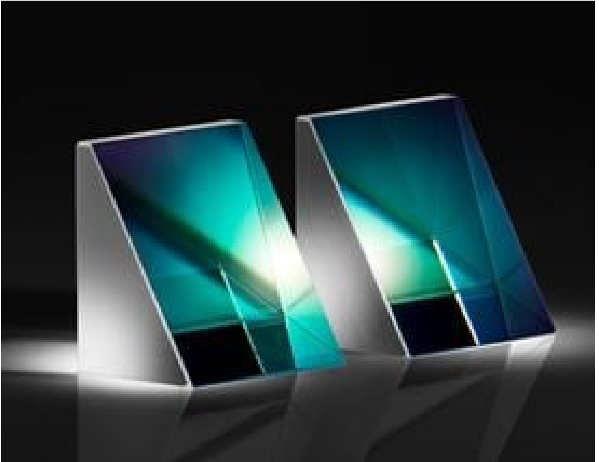
#47-244 NIR I Coated, Unmounted Anamorphic Prism Pair