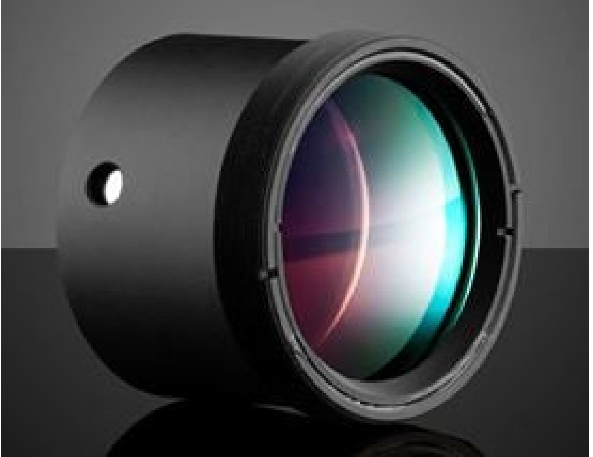
#58-520: Nikon 200mm Tube Lens