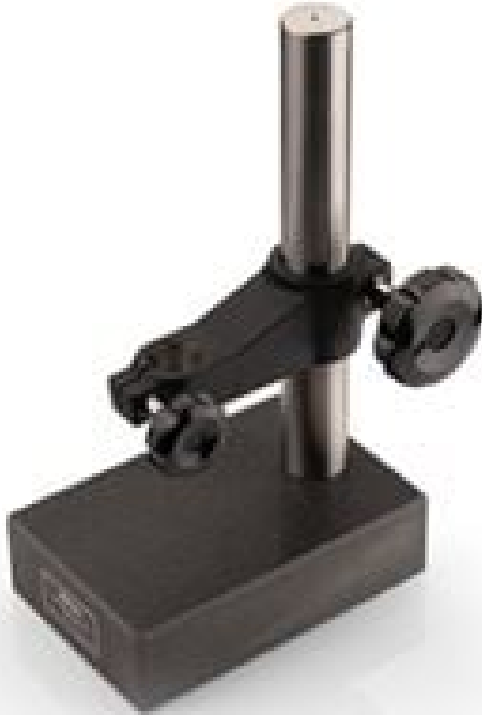
MS-32G Granite Measurement Stand