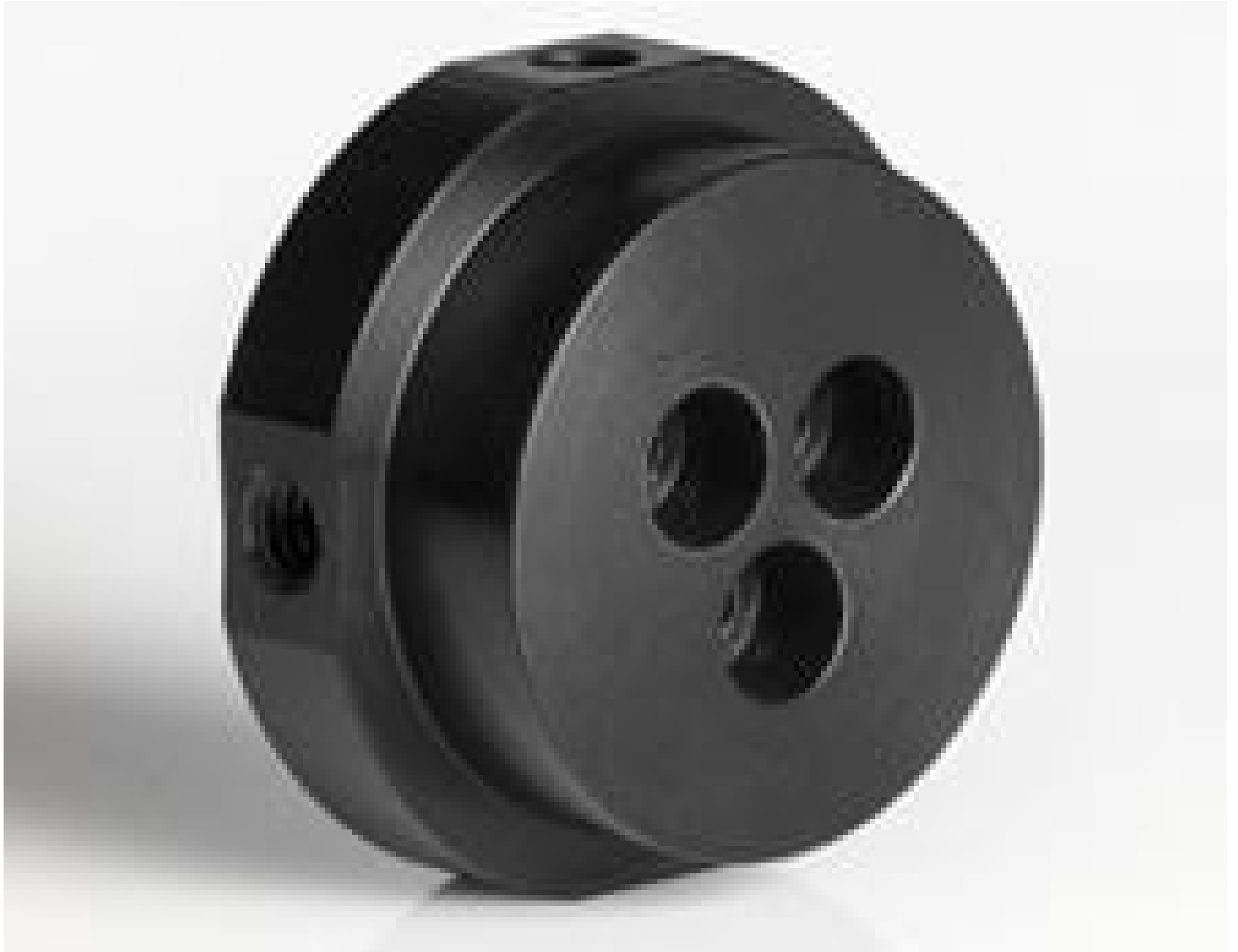
Mounting Plate for 12.7mm Diameter Off-Axis Mirrors, #34-425