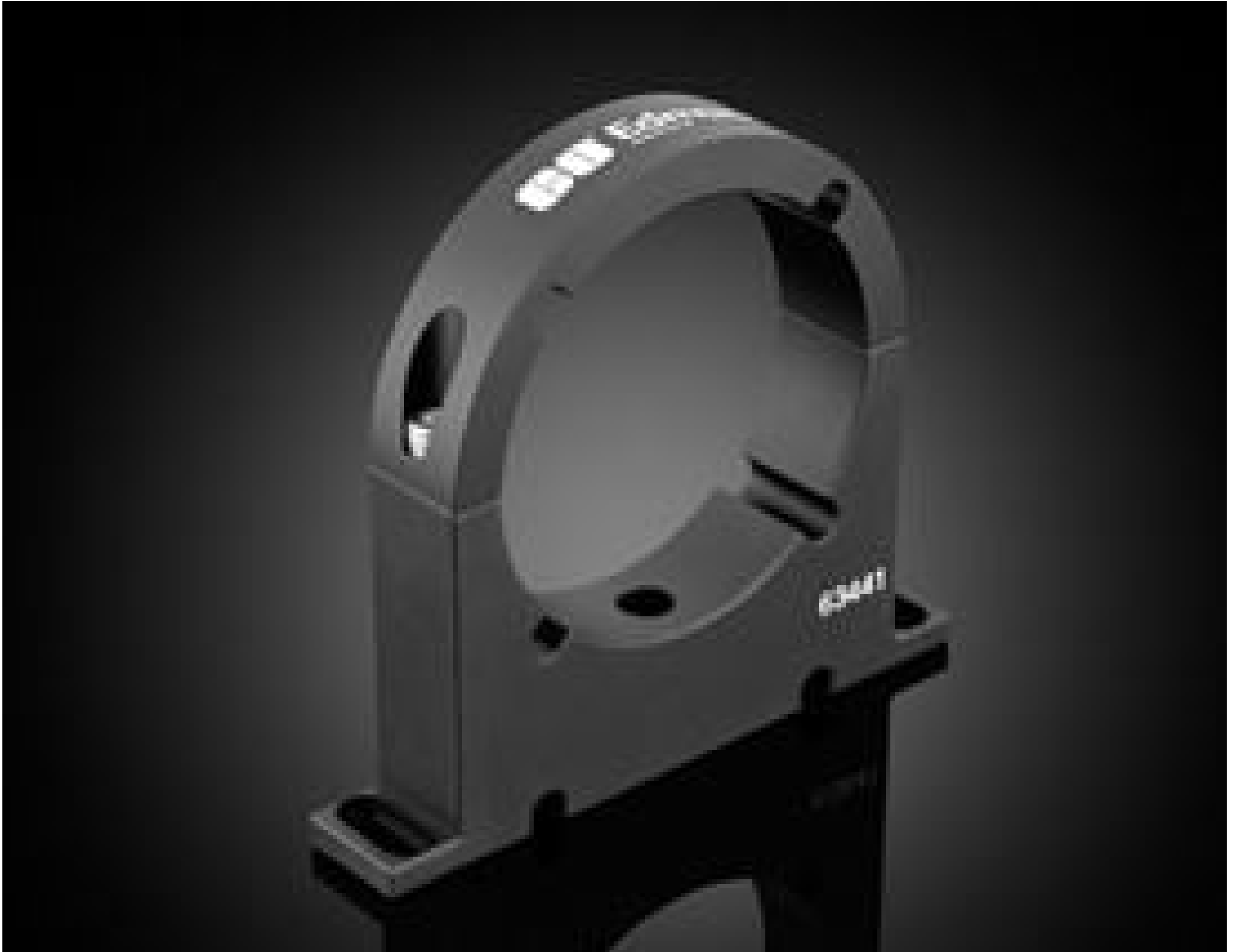
#63-441: Mounting Clamp, 90mm Inner Diameter