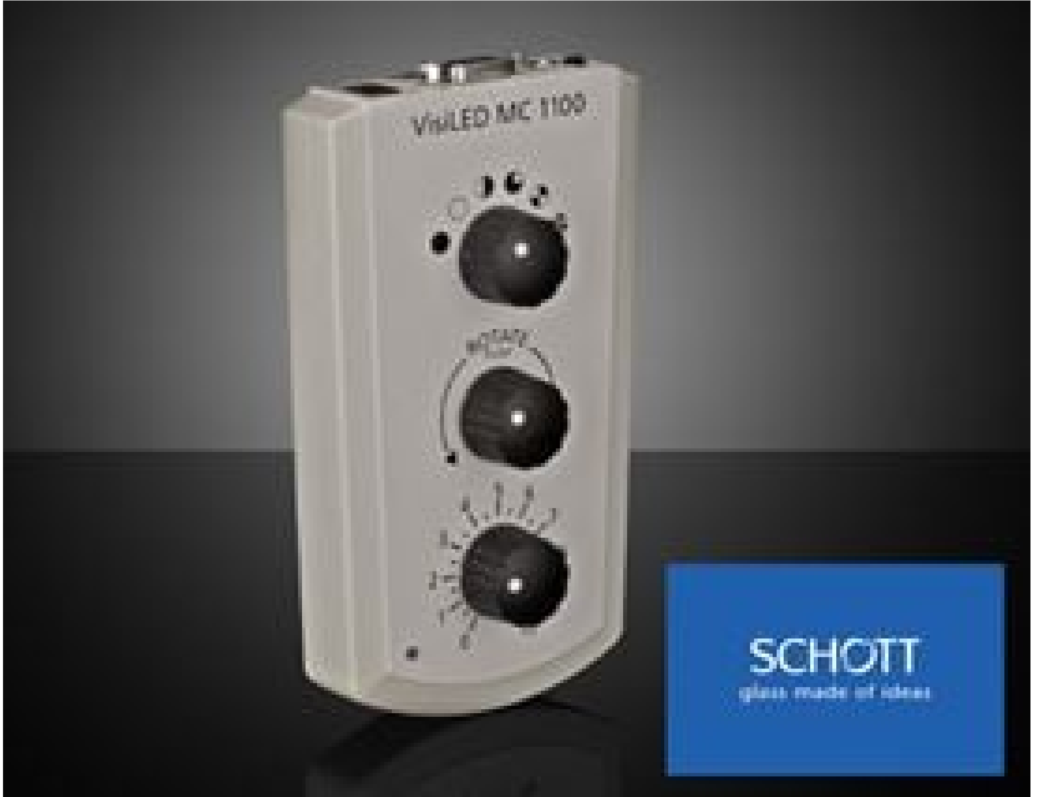
MC 1100, Multifunction Controller, #16-790