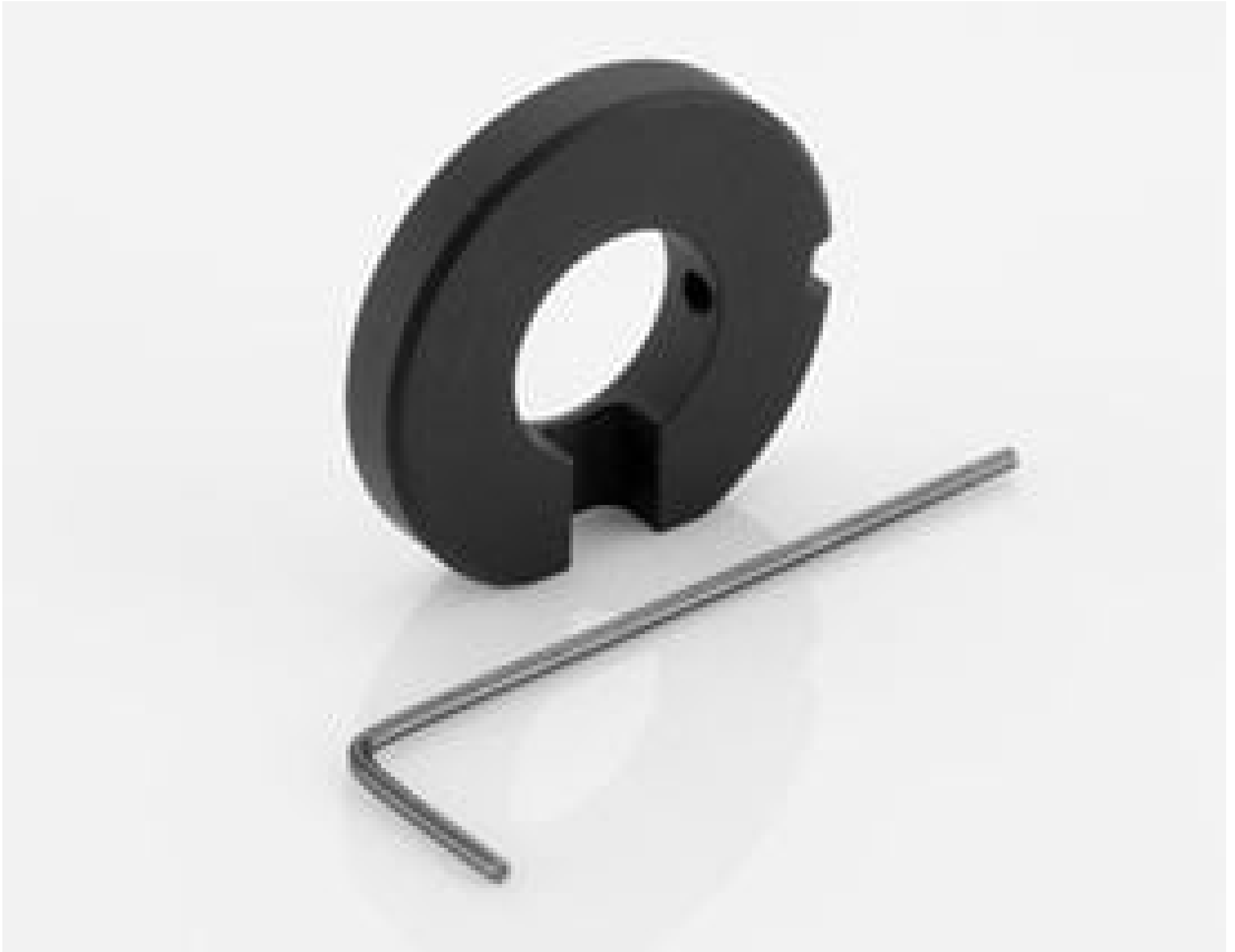
#33-660: Liquid Lens Holder for 25mm Cx Lens