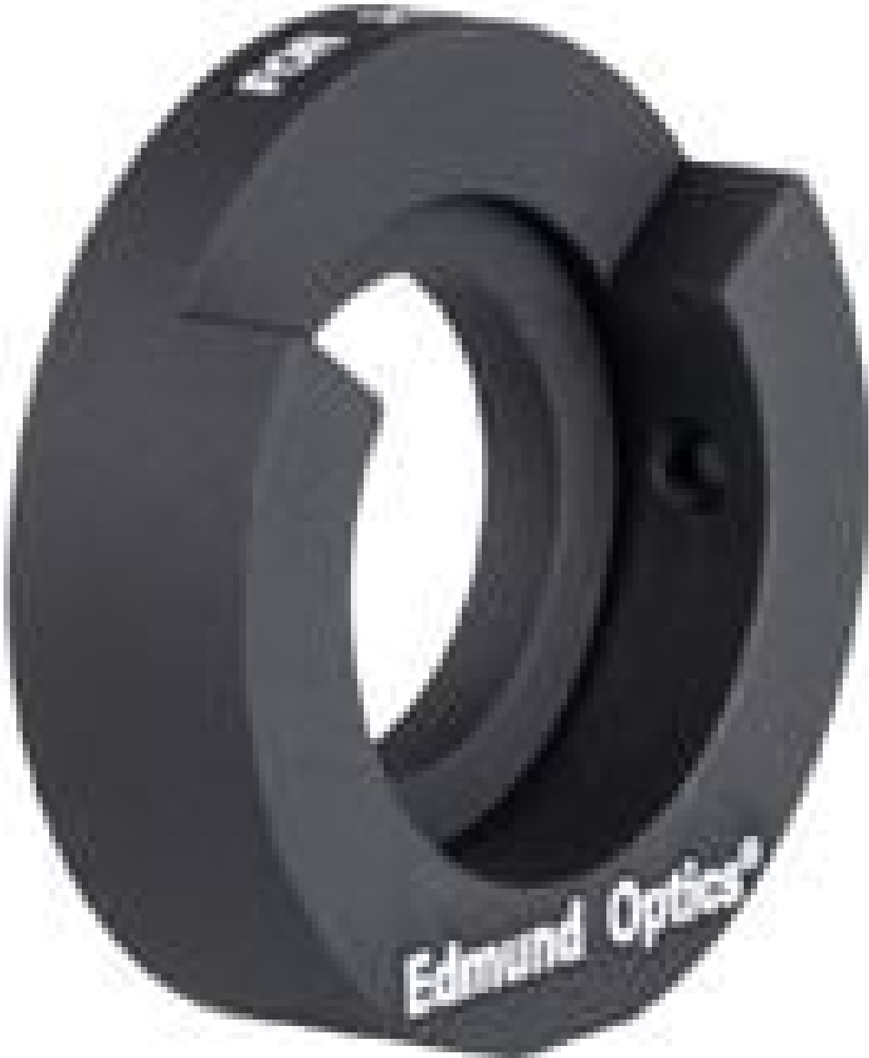
Iris Mount for 21mm Outer Diameter Irises, #54-862