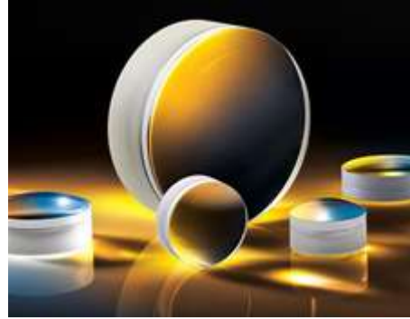
#49-356 - 25mm Dia. x 50mm FL, VIS-NIR Coated, Achromatic Lens £108.80