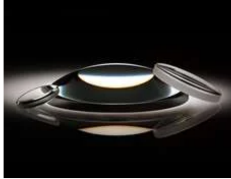
#45-499 - 20.0mm Dia. x 20.0mm FL, VIS-NIR Coated, Plano-Convex Lens £42.80