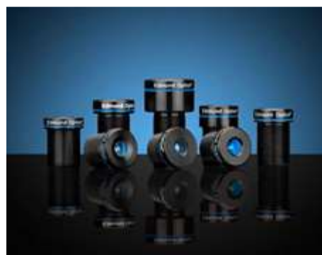
M12 Lenses (S-Mount Lenses)