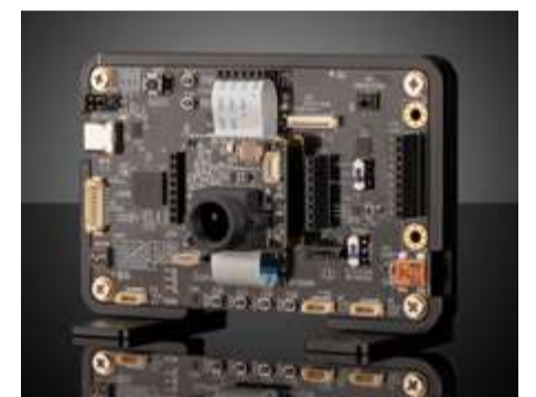
Corning® Varioptic® AF Explorer Autofocus Board Level Camera for Liquid Lenses