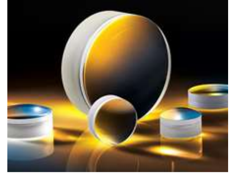
#49-371 - 30mm Dia. x 50mm FL, VIS-NIR Coated, Achromatic Lens £132.80