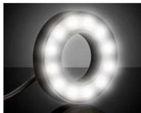
Machine Vision Lighting