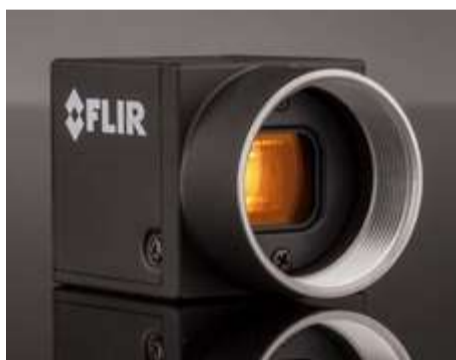
Teledyne FLIR IIS Blackfly S USB 3.1 Cameras