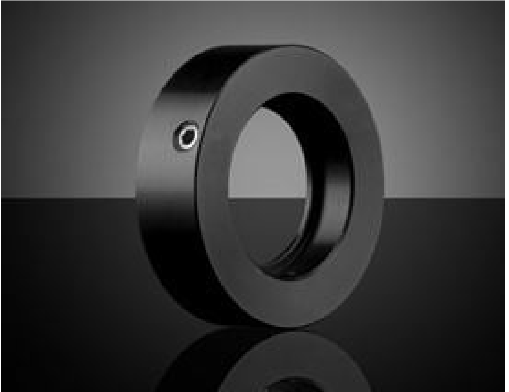
M25.5 x 0.5 Adapter for 18mm Dia. CompactTL™ Telecentric Lens, #88-212