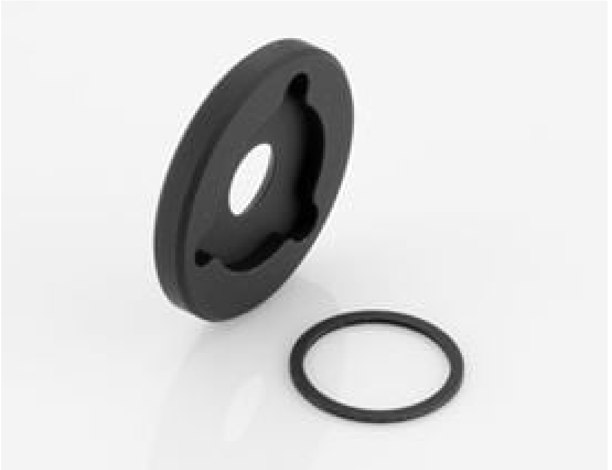
Filter Holder for Cxlens