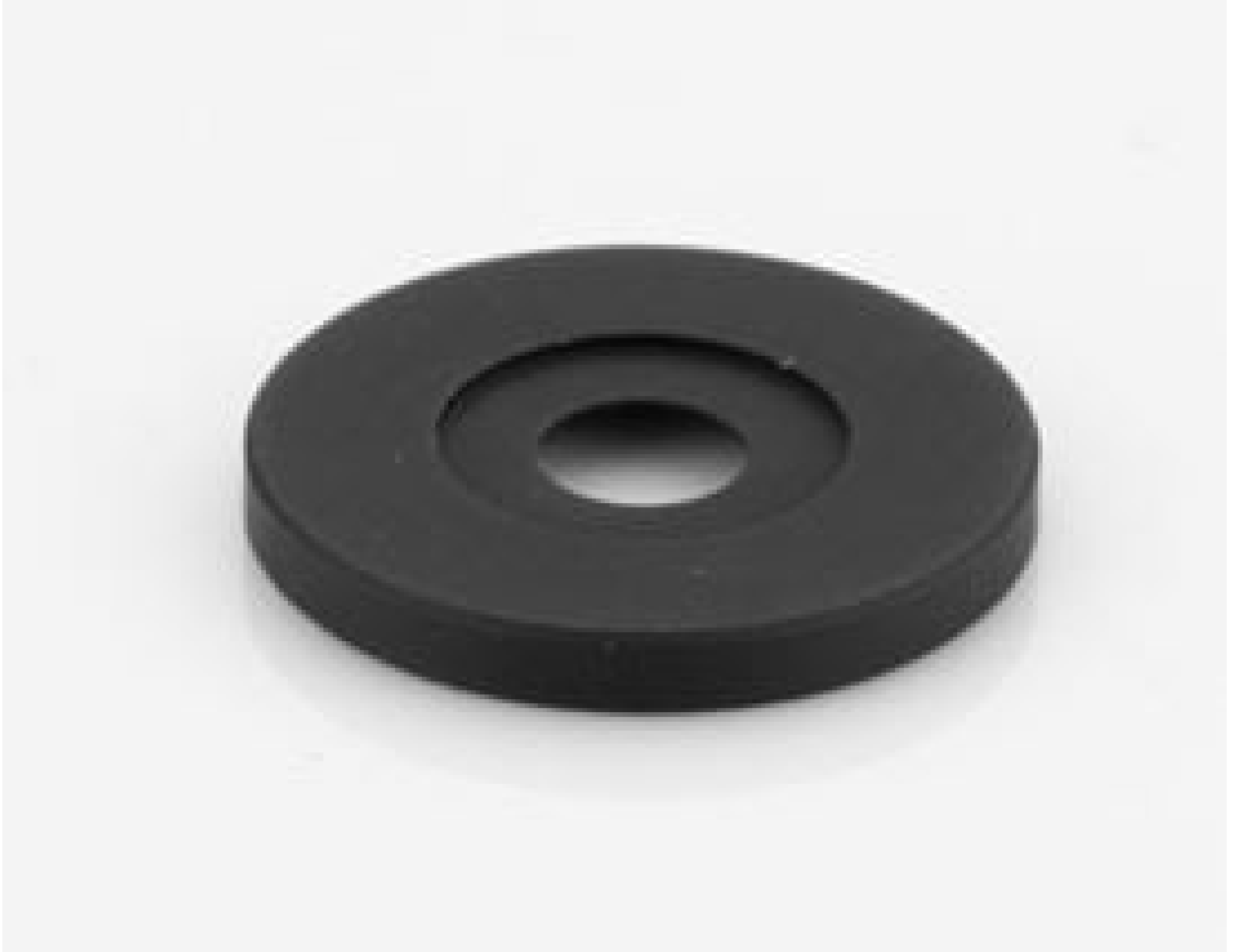
Aperture for Cx Lens (representative photo). Aperture varies by stock number. View PDF drawing for additional information.