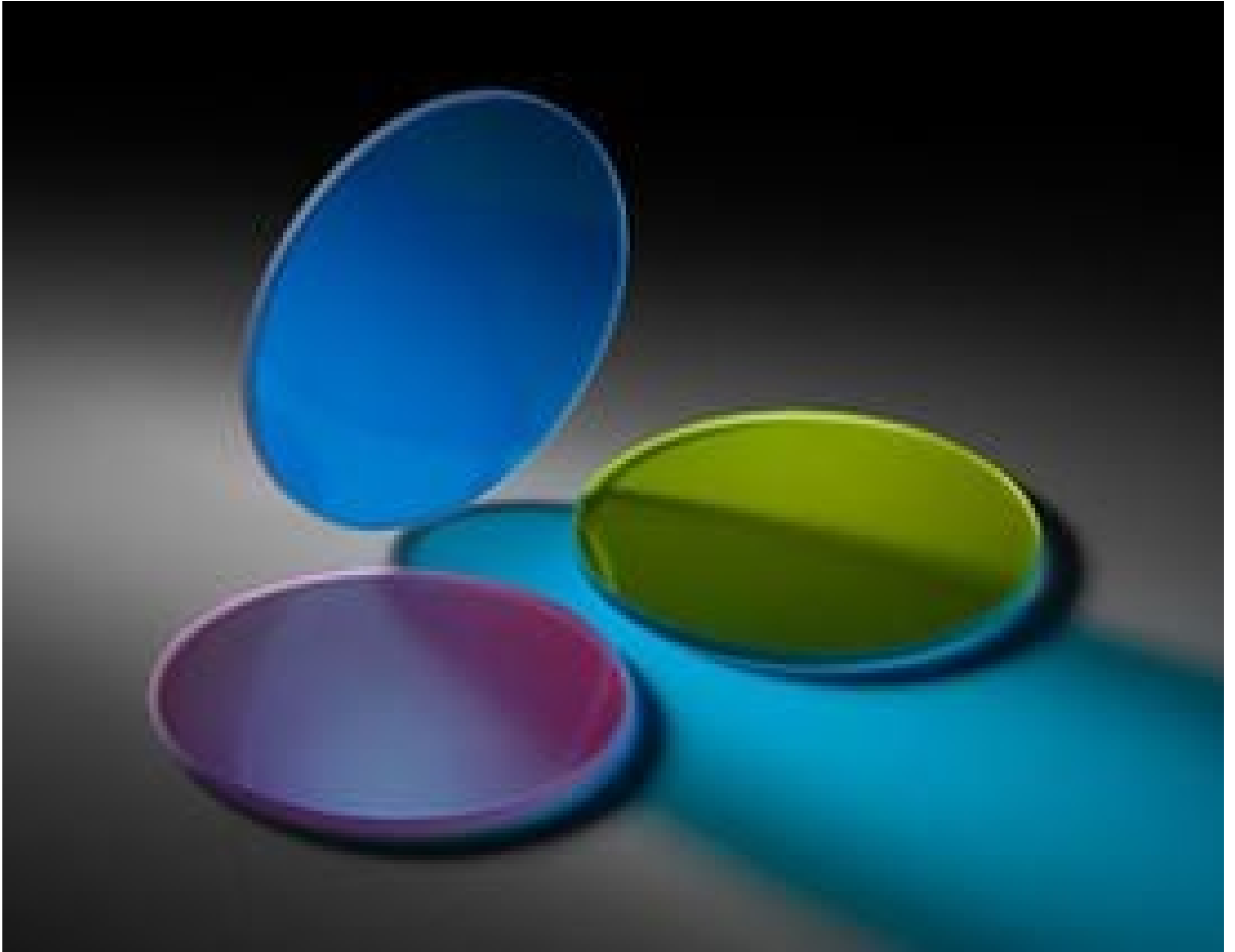
Cyan, Yellow, and Magenta Dichroic Filter Kit