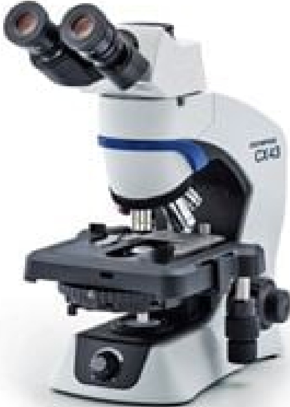
Image shown is full assembly. Each component sold separately. See Technical Information tab for additional details.