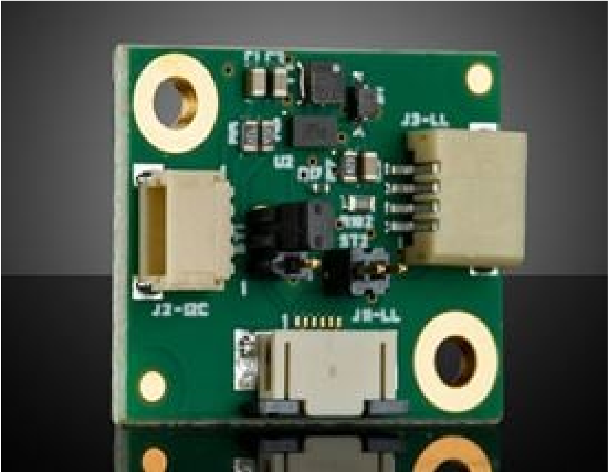
Corning® Varioptic® Variable Focus Liquid Lens Driver Board with Maxim MAX14574 Driver and I2C/DC Input