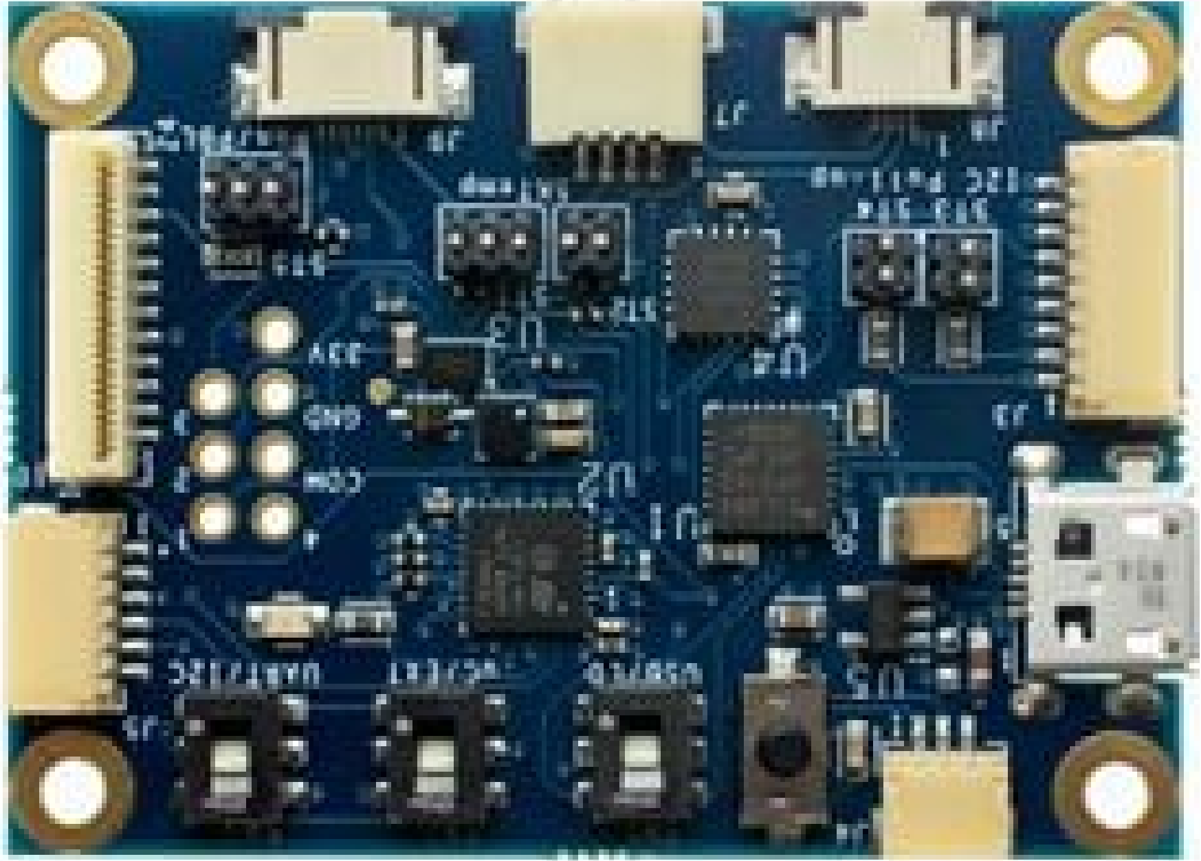
USB-MUniversal Driver Board