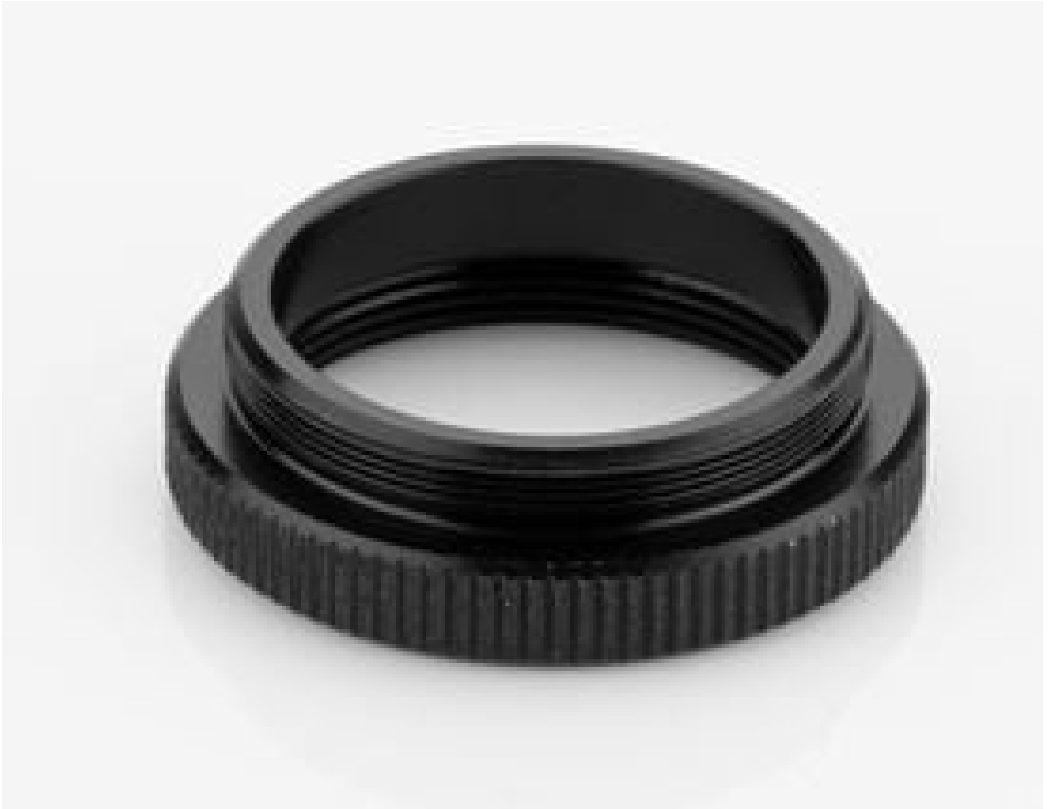
#56-784: C-Mount Adapter for 6 Position Filter Wheel and Assembly