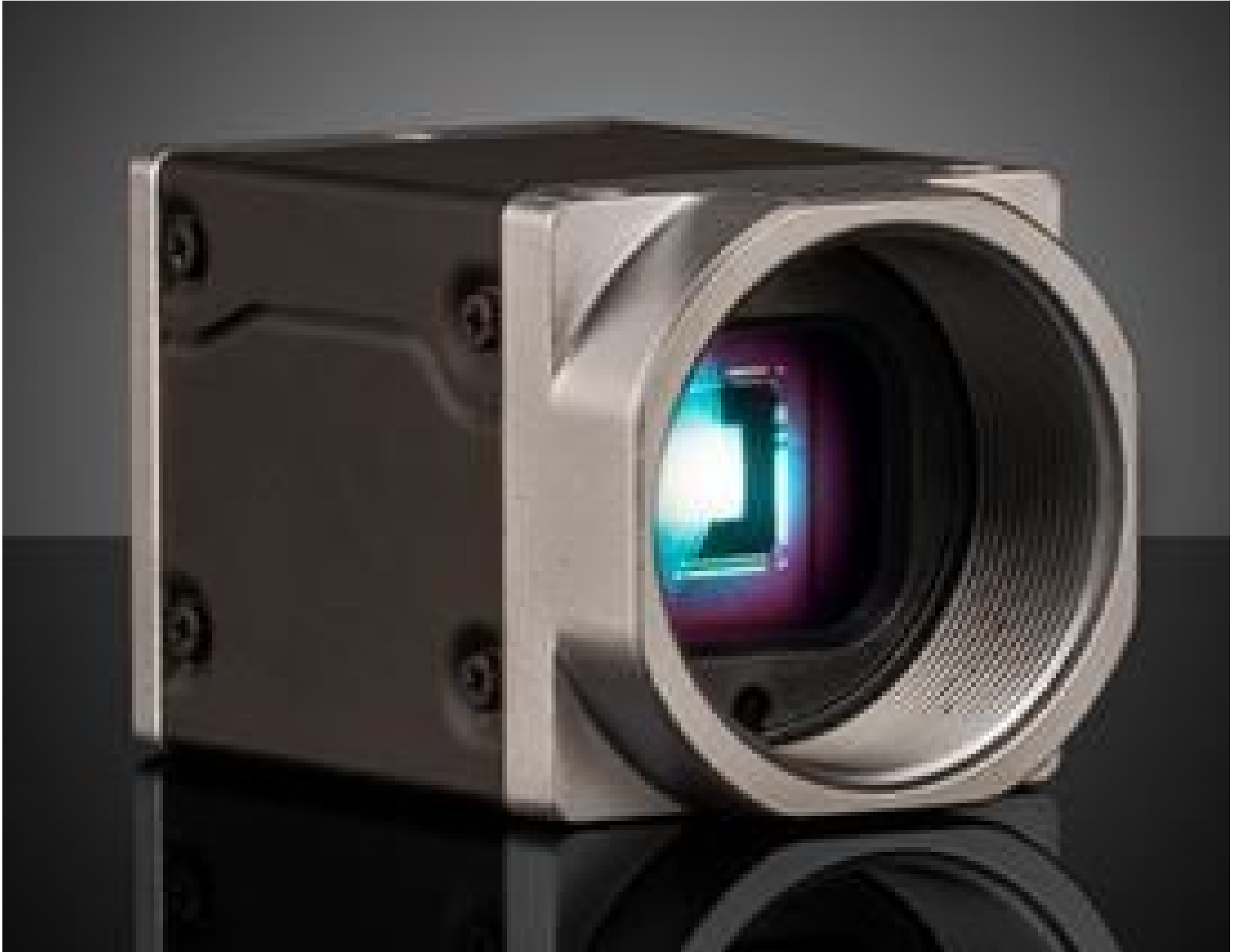
Basler ace2 USB 3.0 Cameras (Front)