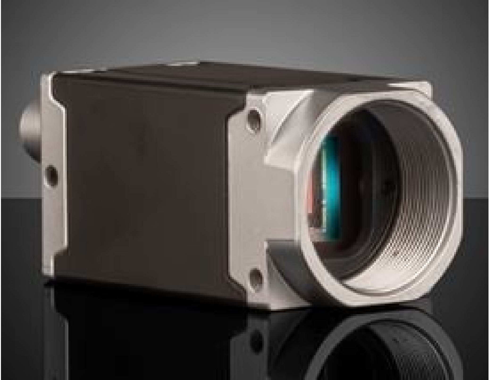
Basler ace2 GigE Cameras (Front)