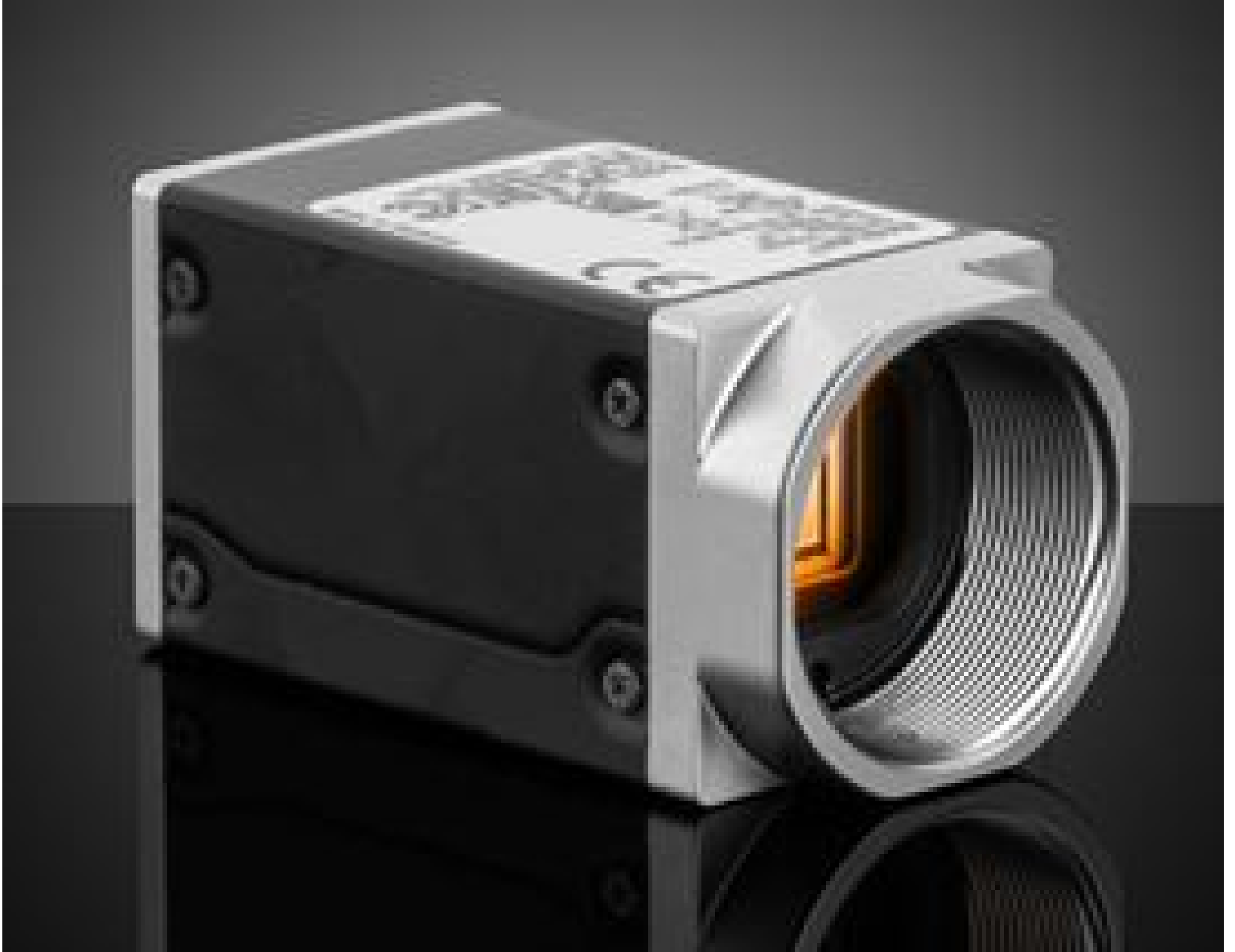
Basler ace2 Ultraviolet (UV) GigE Camera