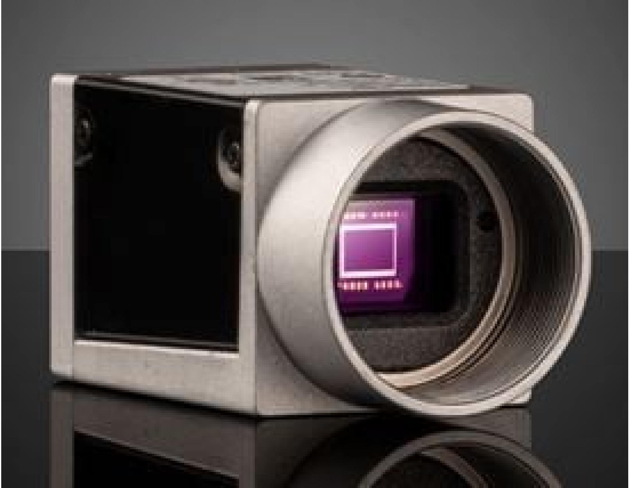
Basler ace GigE Cameras