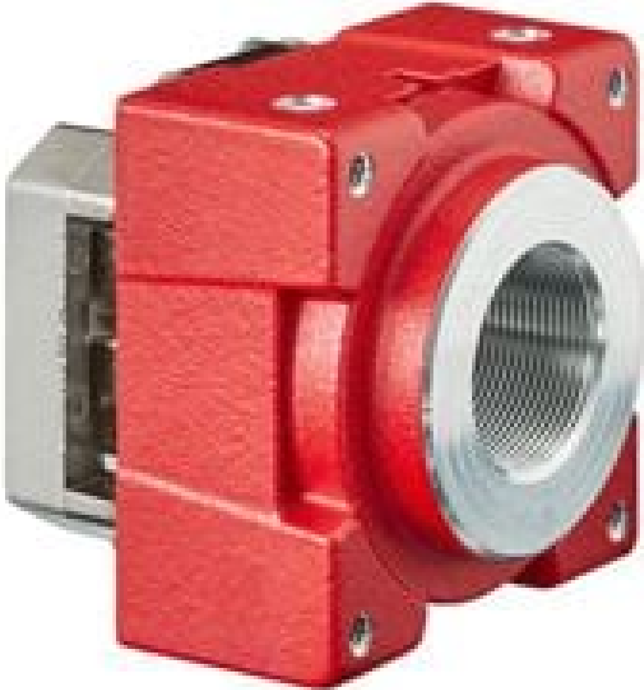
Allied Vision Alvium Camera, Partial Housing, S-Mount (Front)