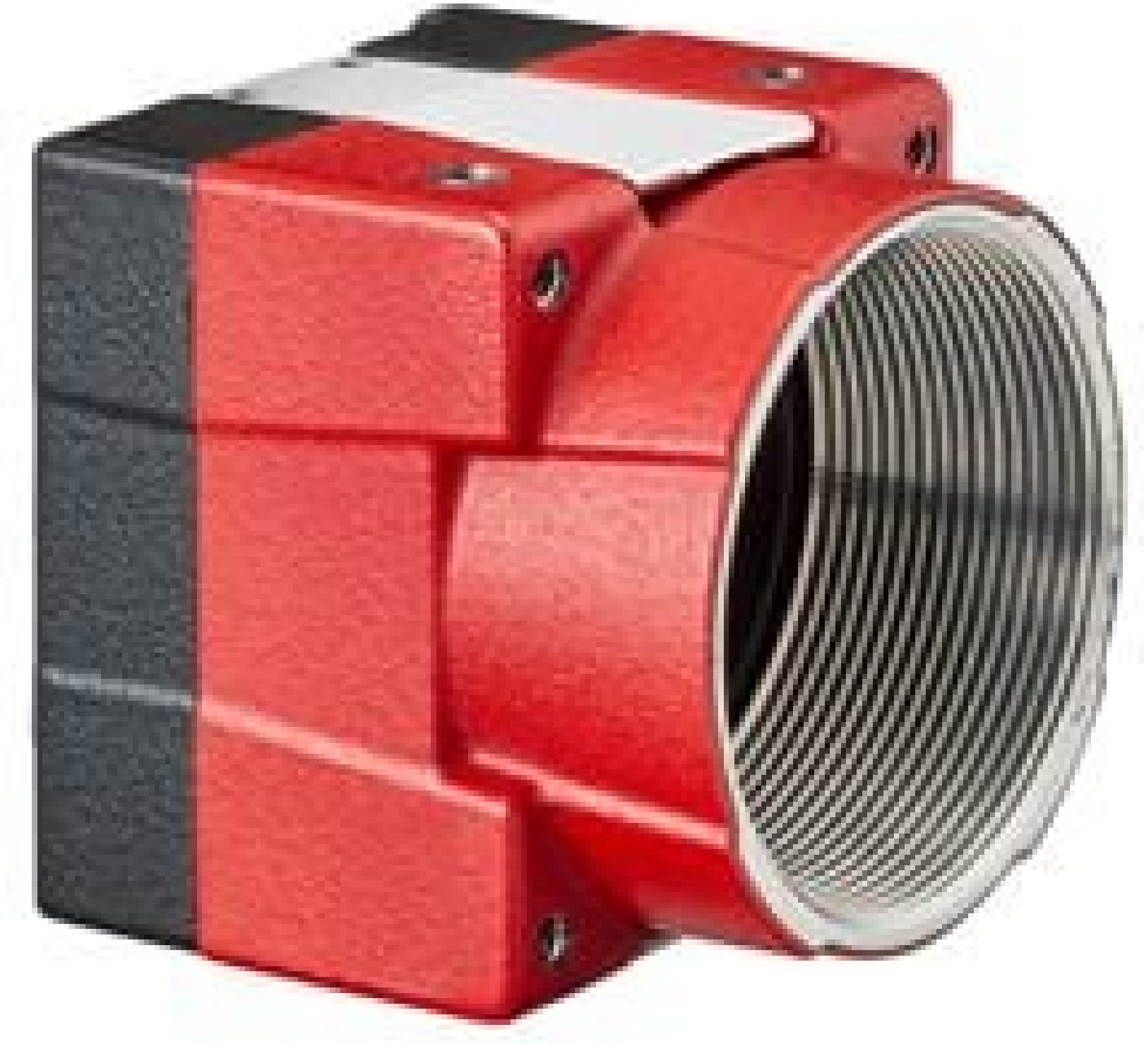
Allied Vision Alvium Camera, Full Housing (Front)