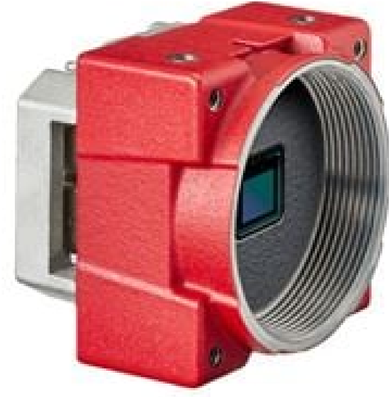
Allied Vision Alvium Camera, Partial Housing, CS-Mount (Front)