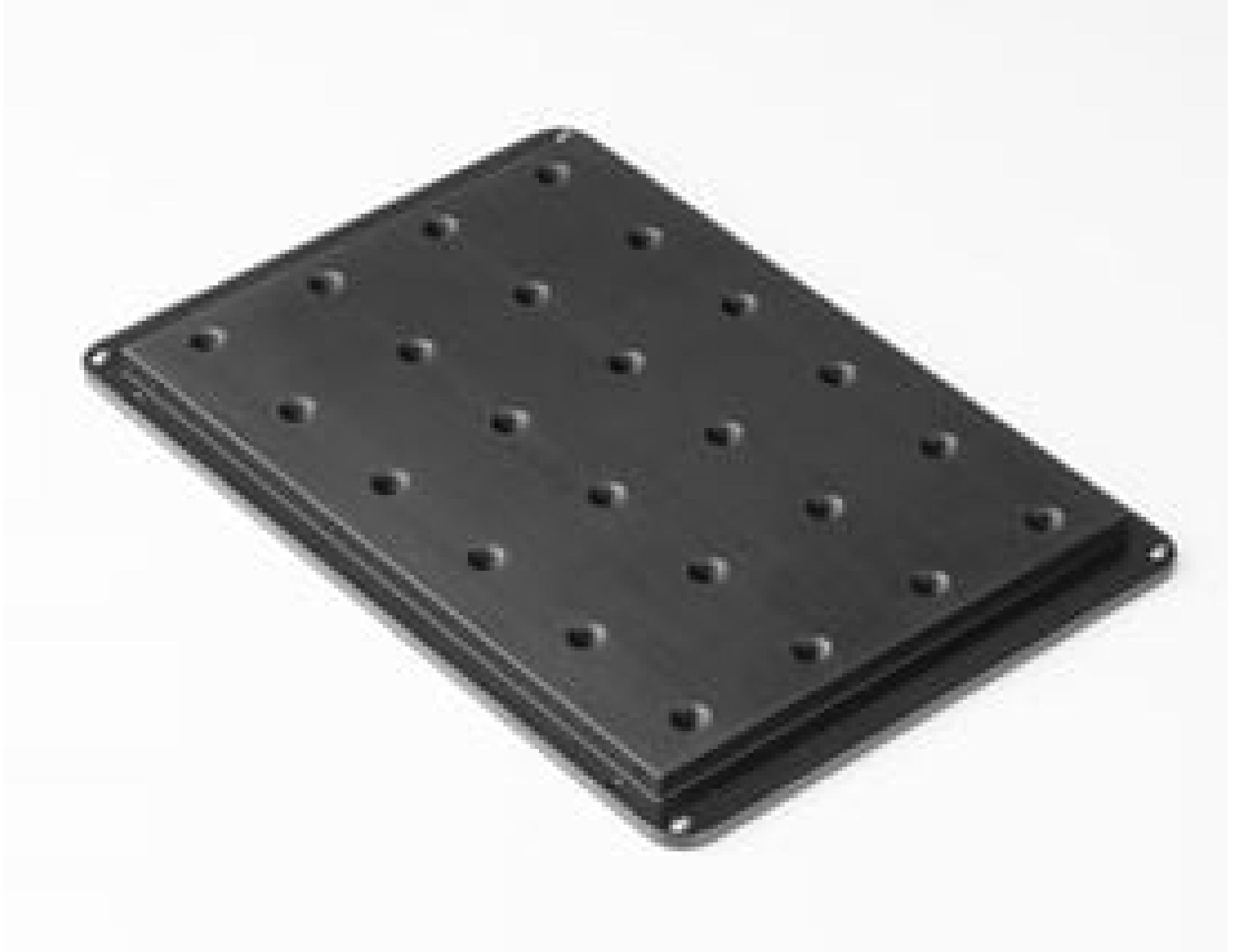
XY Microscope Stage Insert, Breadboard