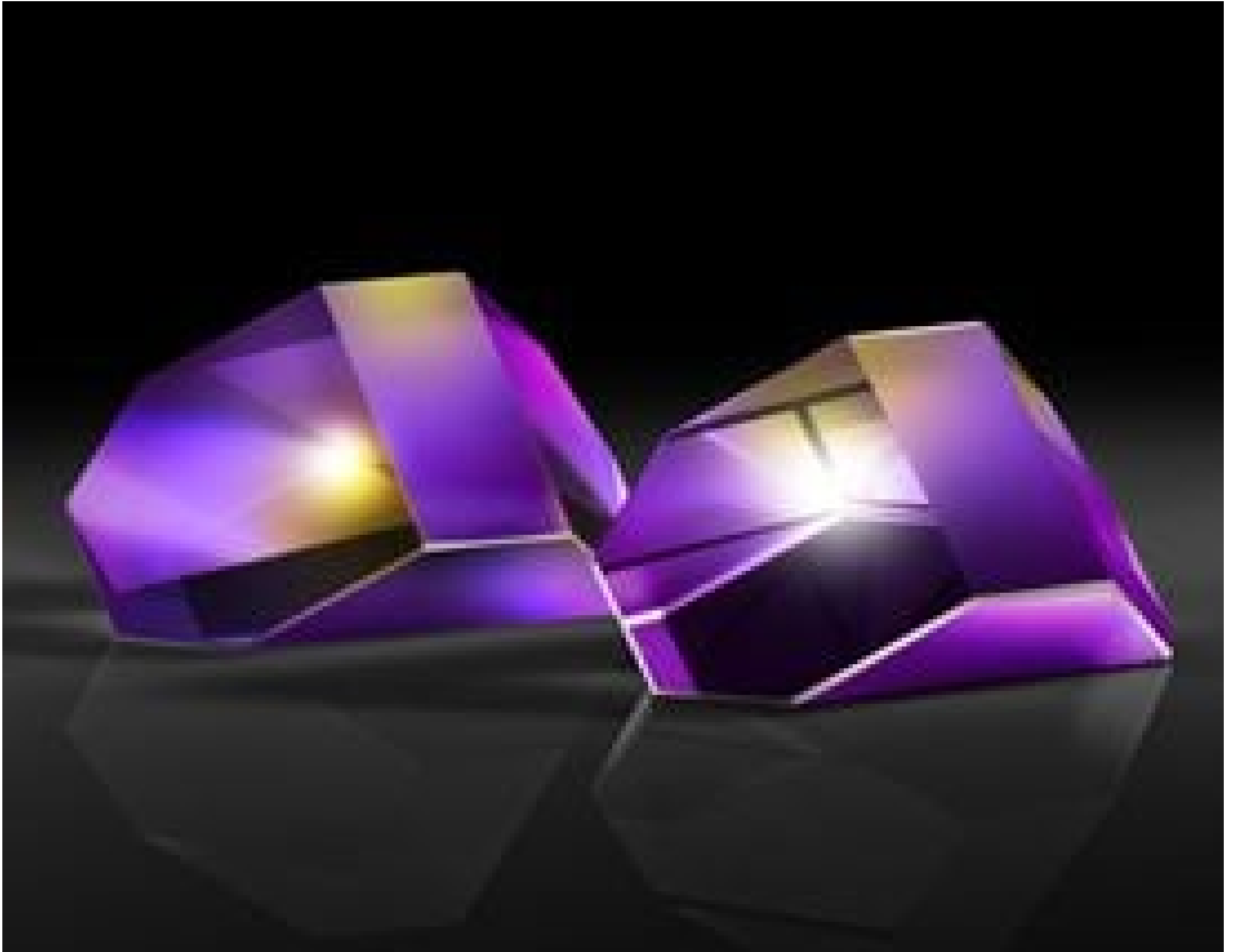
Amici Roof Prisms