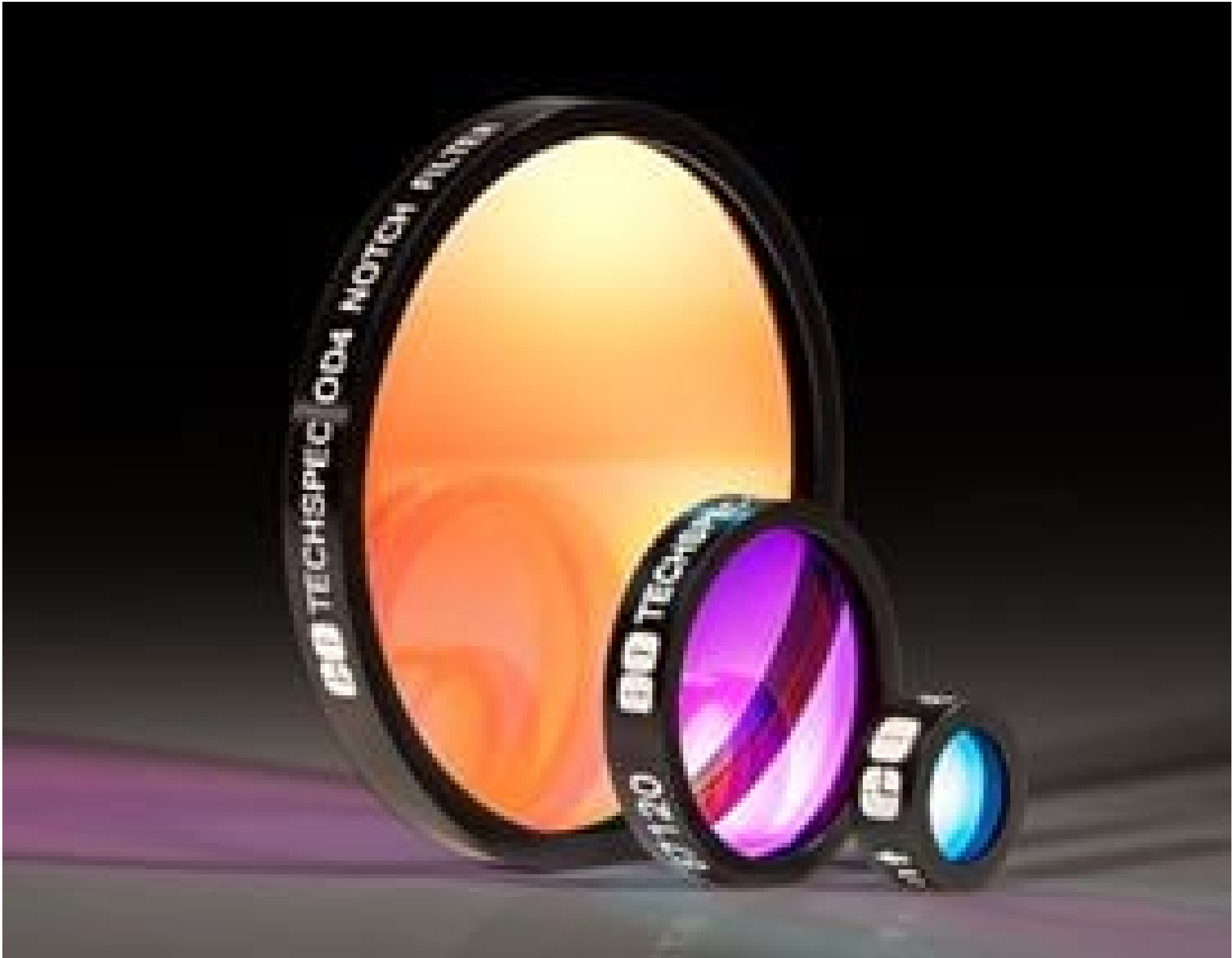
TECHSPEC OD 4.0 Notch Filters