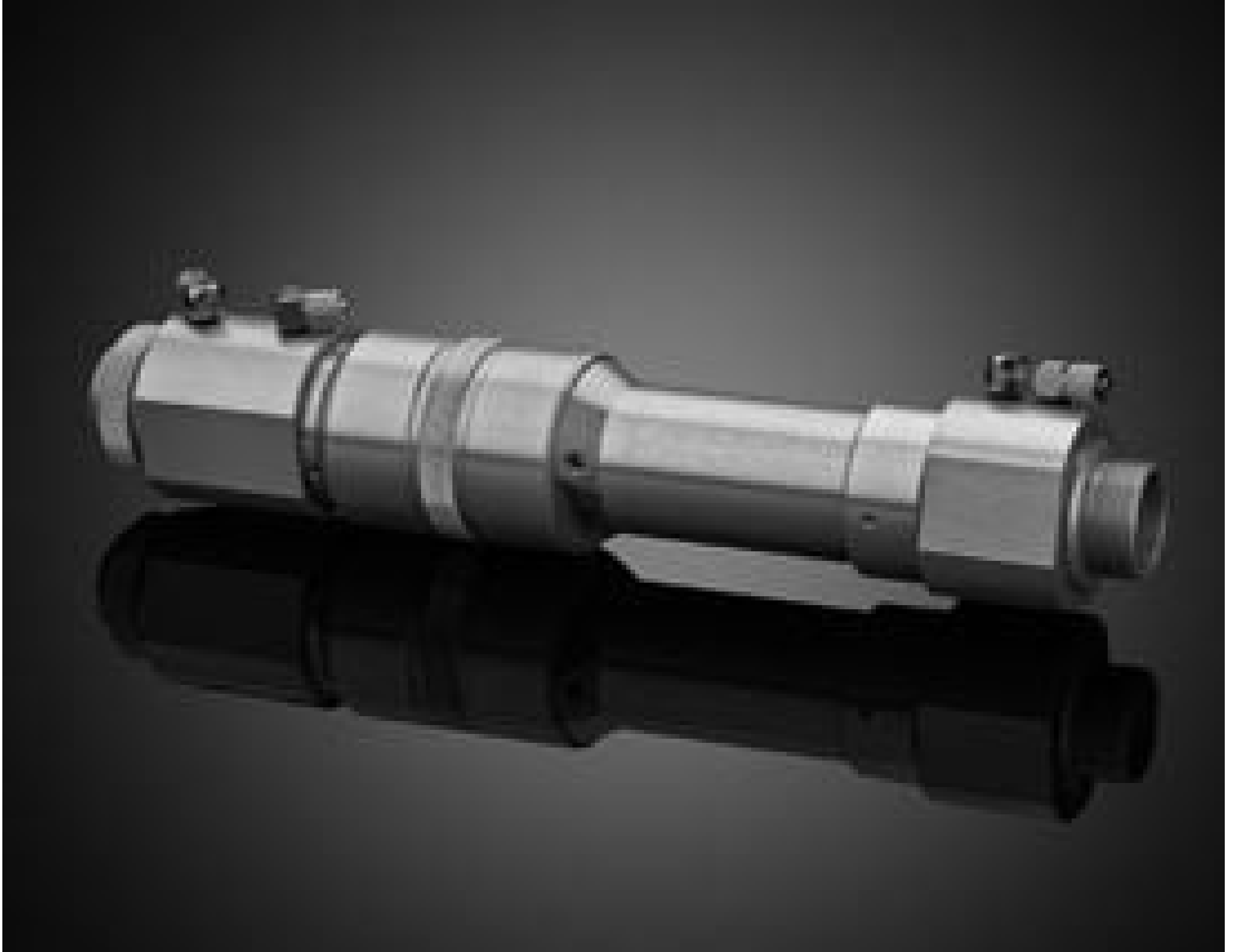
#25-839: 9.4µm Flat Top Beam Shaper | πShaper 12_12_9.4