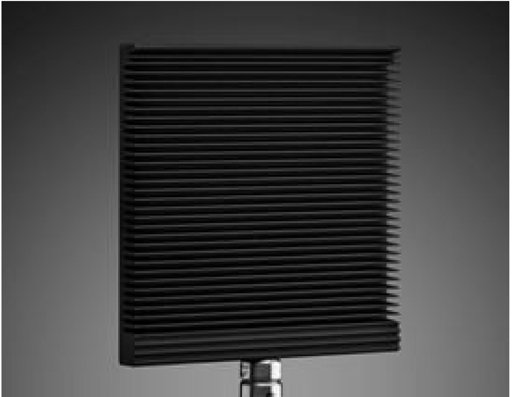
Acktar Blackened Laser Beam Block